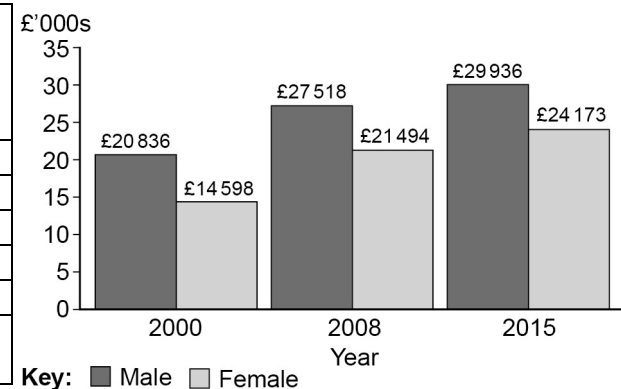
Figure 4: Full-time annual earnings before tax, UK, 2000 to 2015