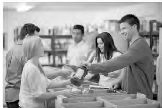
Hilfe für Asylanten