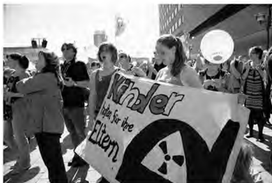
Jugendbewegung gegen Atomkraft