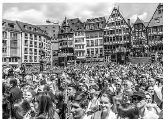
Abendveranstaltung in Frankfurt zum 25. Jahrestag der Wiedervereinigung