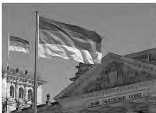
Überall in Deutschland ein Feiertag