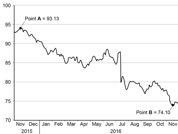
Figure 1: Sterling effective exchange rate index, November 2015 to November 2016