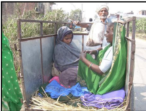
A bicycle trailer being used to transport people

One of the key issues with access to markets is transport. If people cannot get their goods and produce to markets then they are not able to participate in the buying and selling that is crucial to its success. In addition, access to medical care is severely restricted in remote areas. Many people living in developing countries rely on simple bicycle based transport. Whilst excellent for personal use this has some obvious limitations when it comes to moving even small amounts of goods. One solution to this is to design and manufacture bicycle trailers that villagers can use. These are designed to be lightweight, durable and in some cases even able to act as makeshift ambulances.