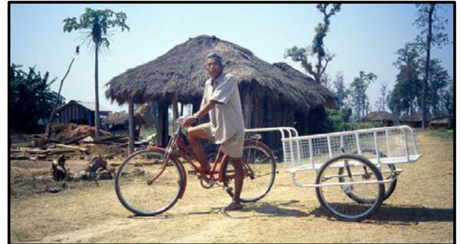
A bicycle trailer being used by a villager in a developing country

Many of the projects undertaken by Practical Action involve engineering activities. For example, increasing access to and providing the ability for people in developing countries to shape markets. Projects have included the development of lagoon fisheries in Sri Lanka, investigating the problems with and reforming livestock markets in Zimbabwe and improving production methods of hibiscus in Sudan. Supporting the development and access to both local and international markets is crucial to helping poor countries to develop.