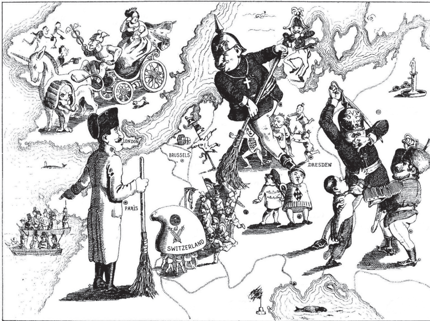
A German cartoon published in August 1849. It was entitled 'A panorama of Europe' and shows the revolutionaries being driven out of Prussia and France to Switzerland and America.