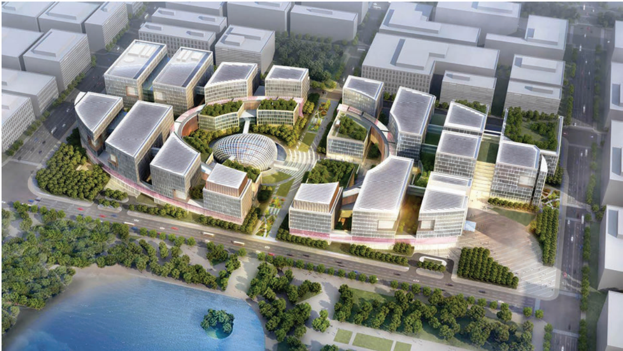
Fig. 2.3 for Question 2

Image of a new high technology industrial park