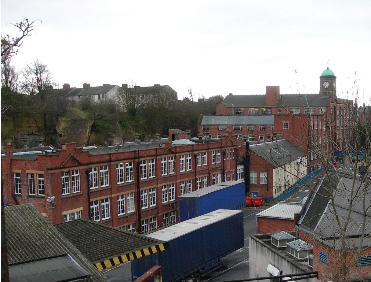
Photograph of a factory