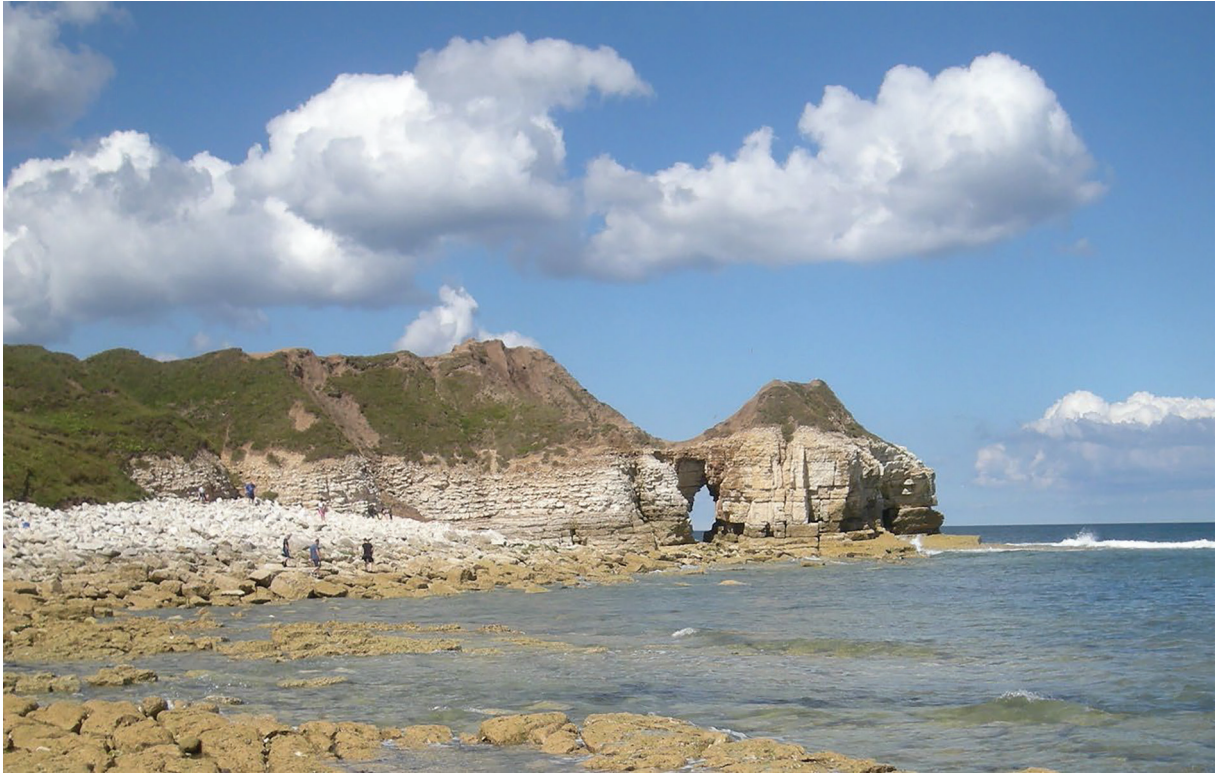
Photograph of a headland