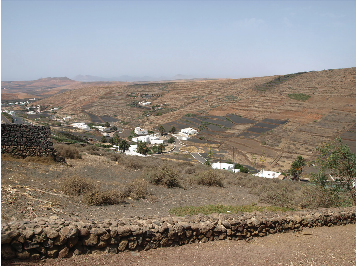
Photograph of a settlement in Lanzarote