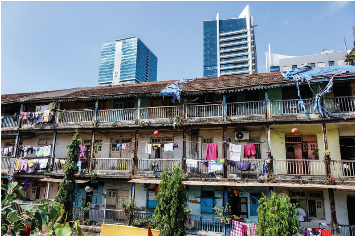
An area of permanent housing in Mumbai