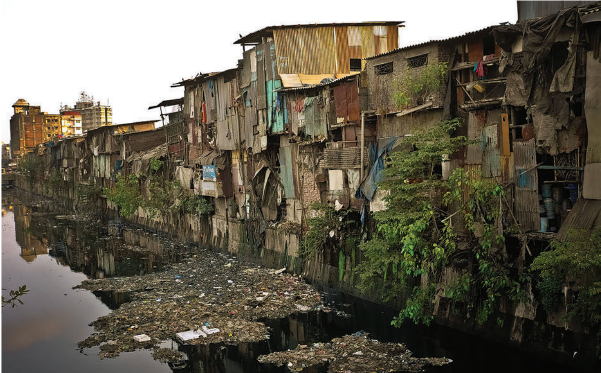
Fig. 2.2 for Question 2