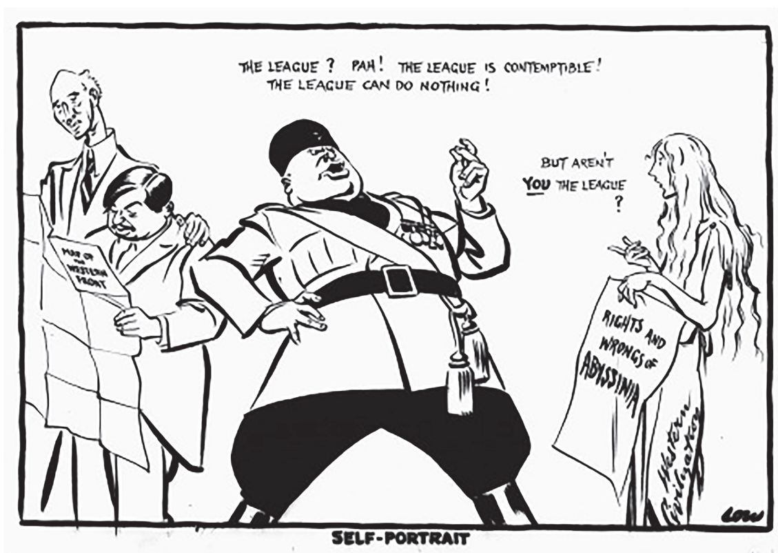
A cartoon published in Britain in February 1935. The figures on the left represent Britain and France.