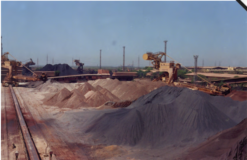
Photograph C for Question 4