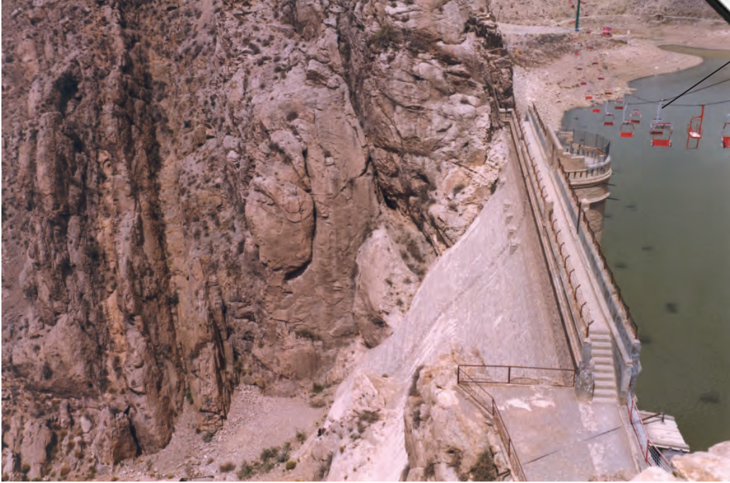
Photograph A for Question 1