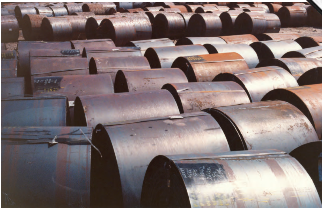
Photograph E for Question 4