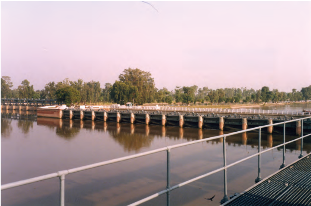
Photograph B for Question 1