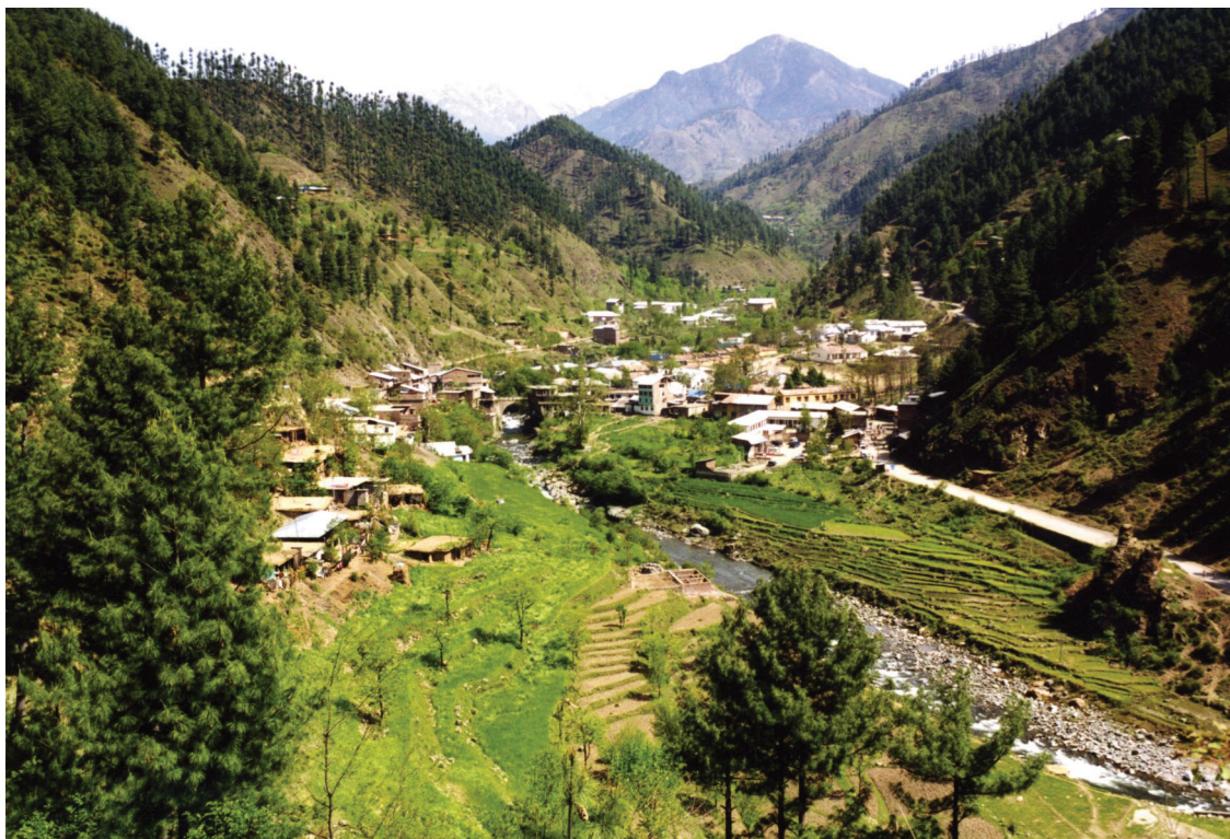
Photograph C for Question 3