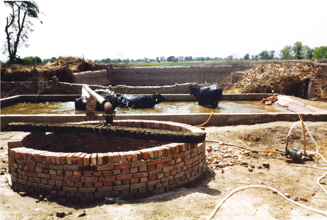
Photograph B for Question 2