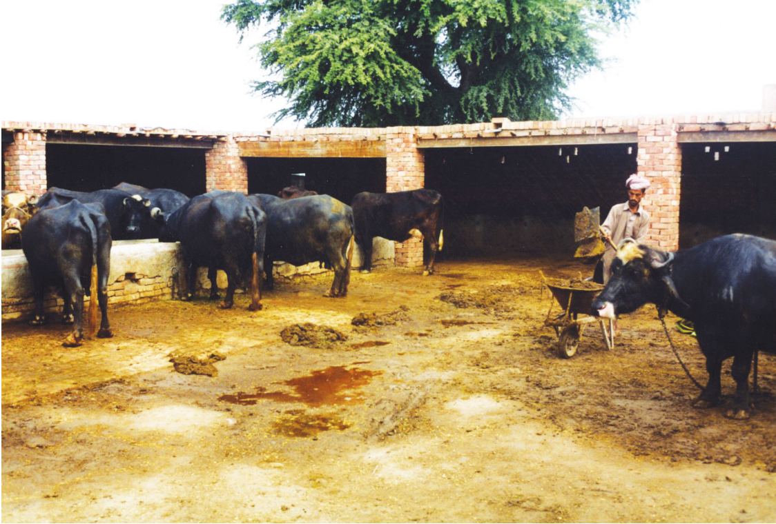
Photograph A for Question 2