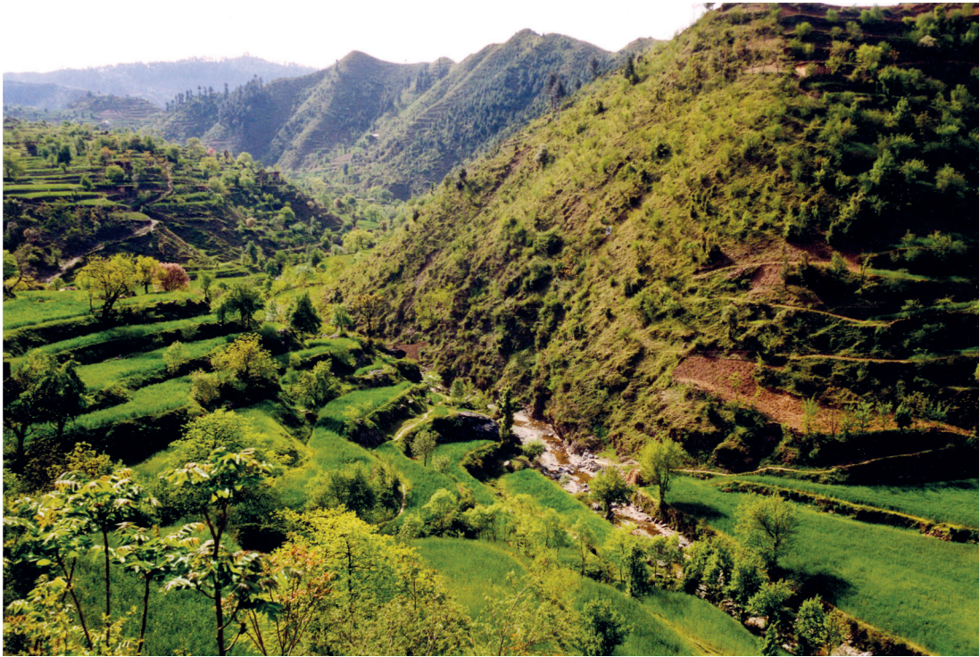
Photograph C for Questions 3 and 4