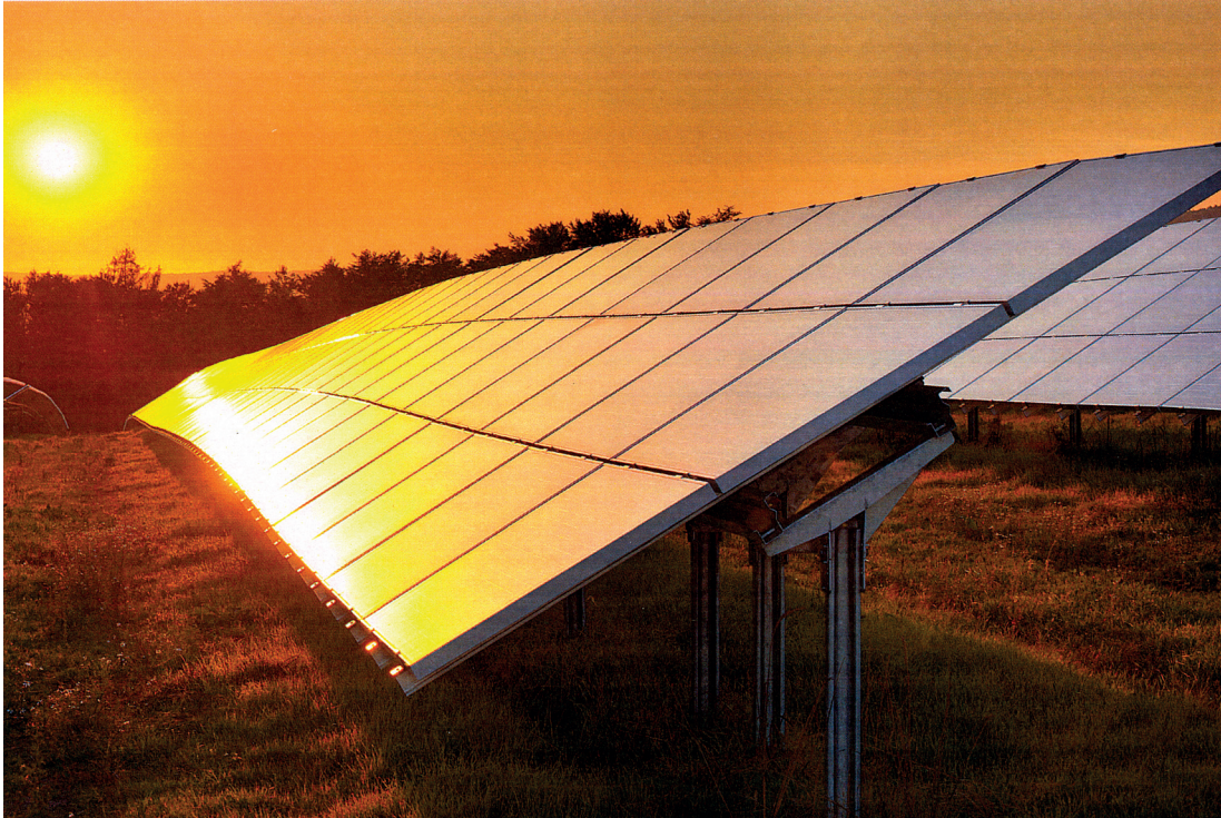
Photograph E for Question 4