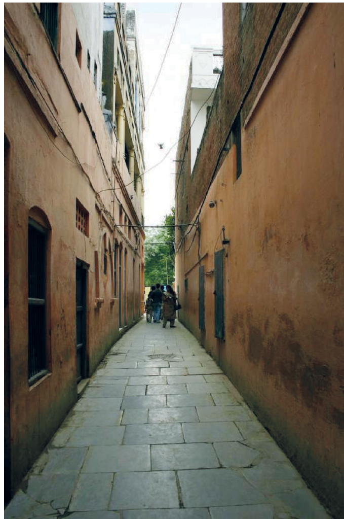
A photograph of an entrance to Jallianwala Bagh, which is largely unchanged since 1919

An entrance to Jallianwala Bagh, Amritsar