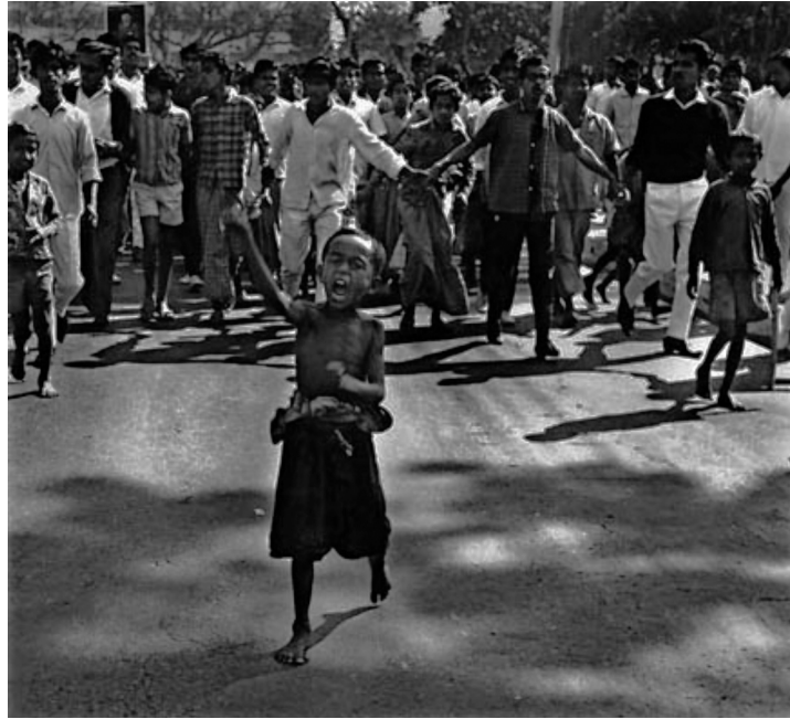
A child leads a protest in East Pakistan 1969

The elections of December 1970 and January 1971 were of immense importance in bringing about an independent Bangladesh. The Awami League won a majority of seats because of resentment about rule by West Pakistan. There had already been student unrest in 1969 and now there was a major constitutional crisis. This led to a non-cooperation movement in East Pakistan. The President and Prime Minister of Pakistan flew to Dhaka for talks with Sheikh Mujibur Rahman but when these failed, the Pakistan army took severe measures and civil war broke out. In April 1971, the Provisional Government of Bangladesh was formed.