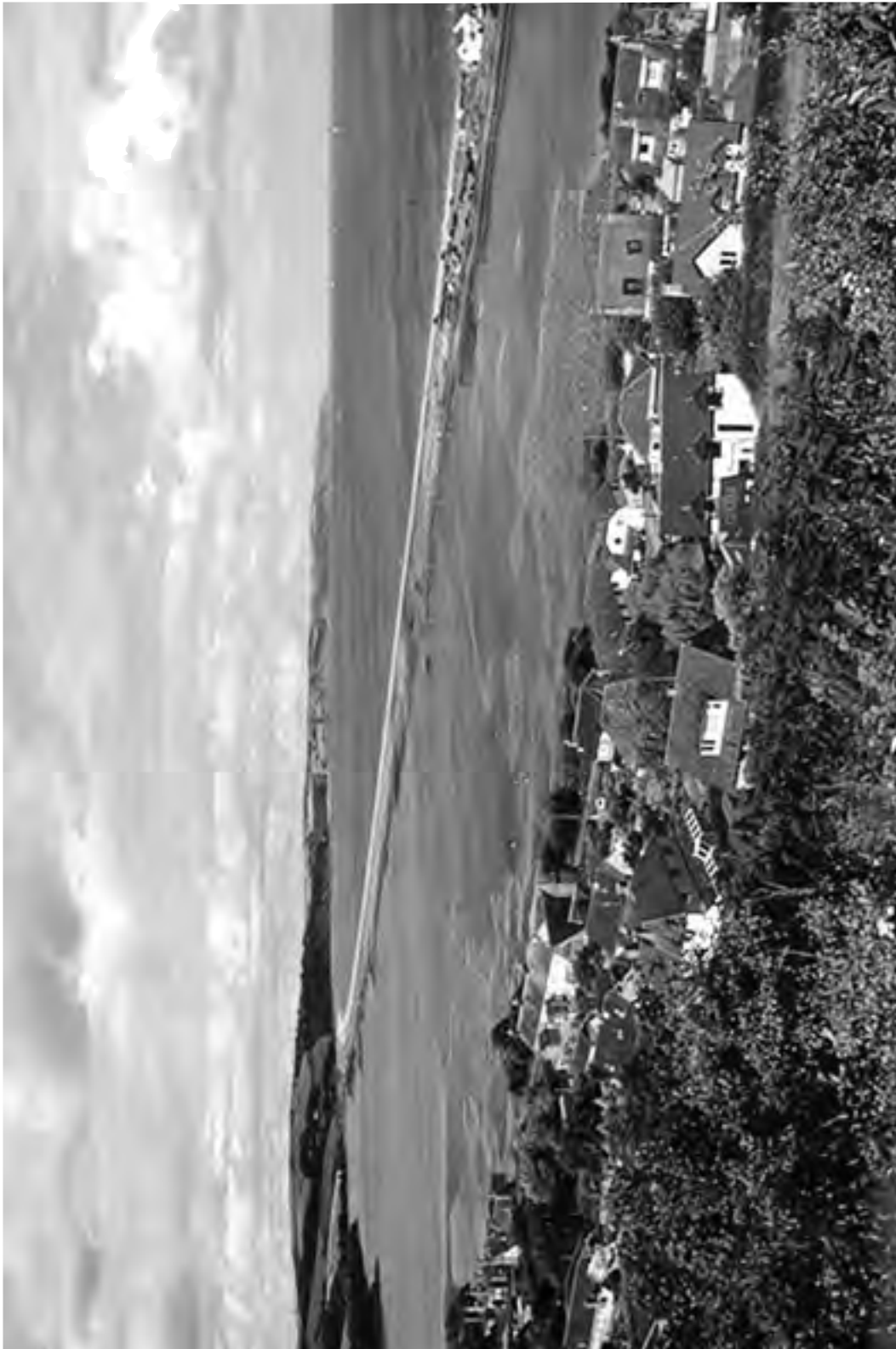
Photograph A for Question 3 (a)