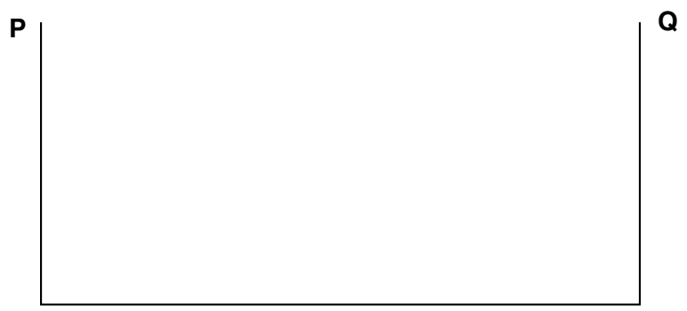
Fig. 4 for Question 3