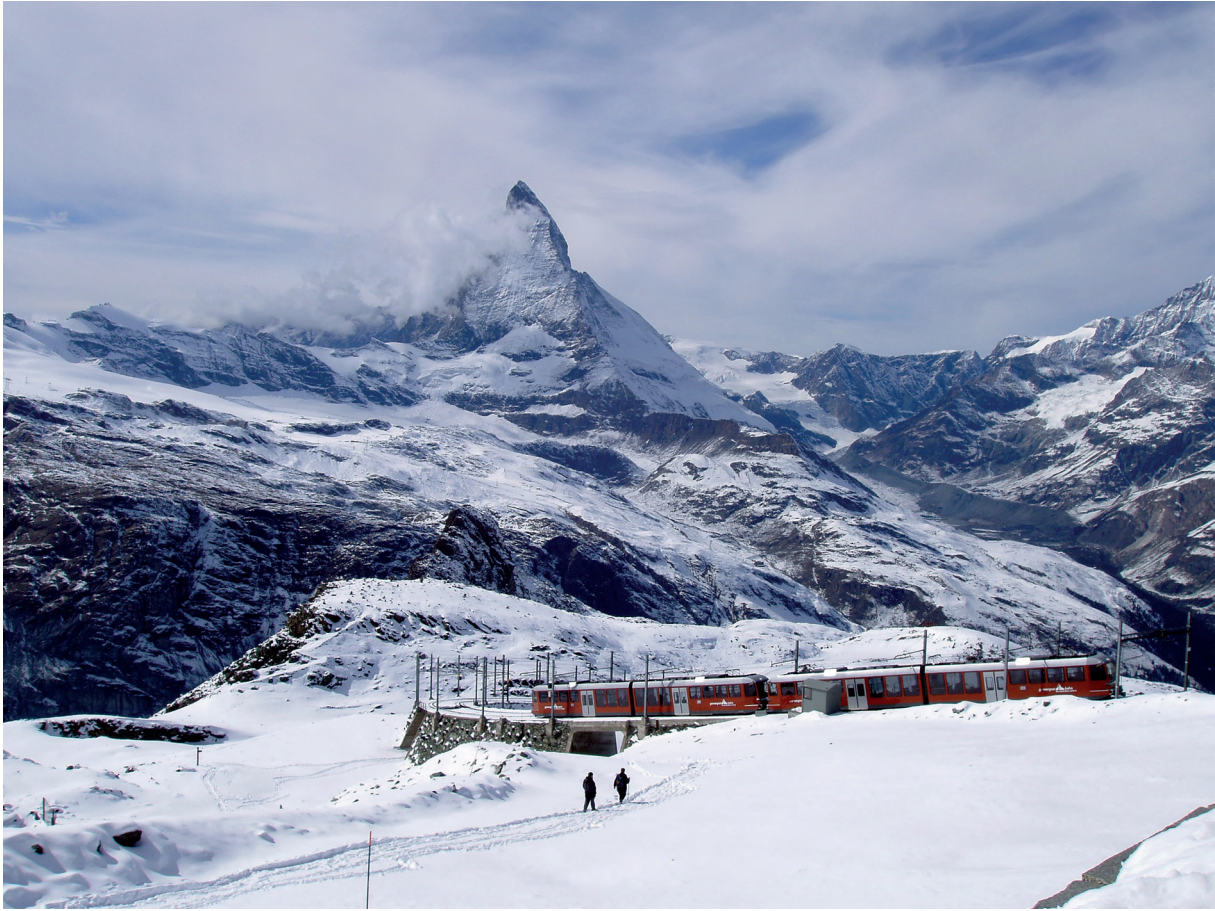
Photograph A for Question 2