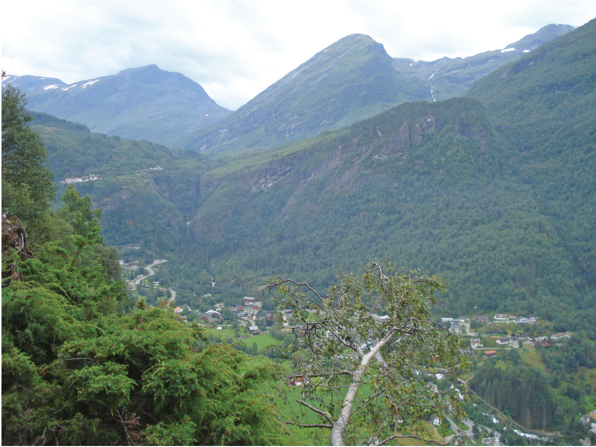
Fig. 1.2 for Question 1