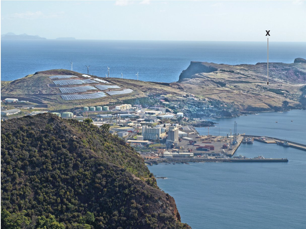
Fig. 6.2 for Question 6