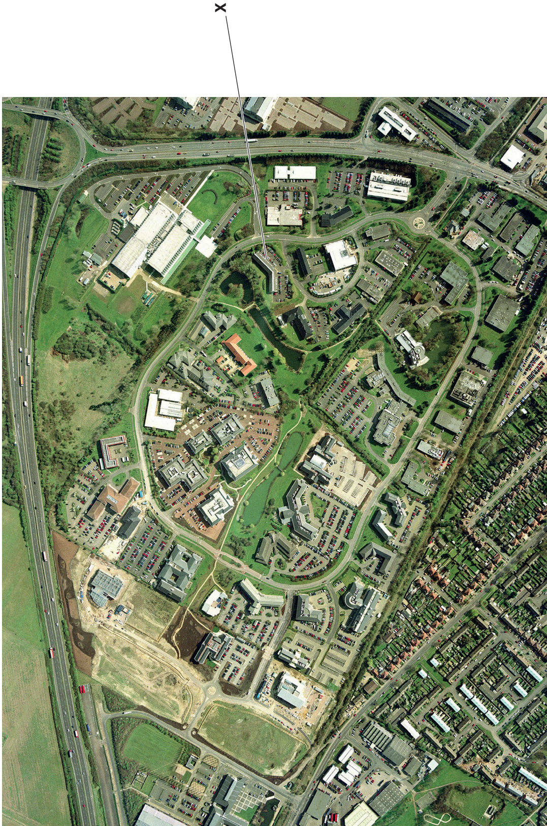
Fig. 1.1 for Question 1 High technology industrial area in 2006