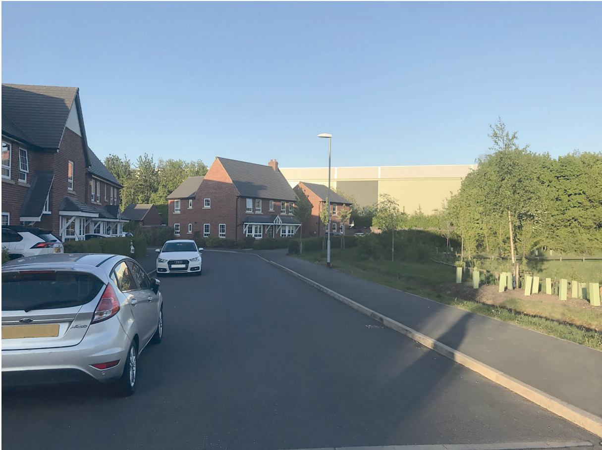
Fig. 3.1 for Question 3