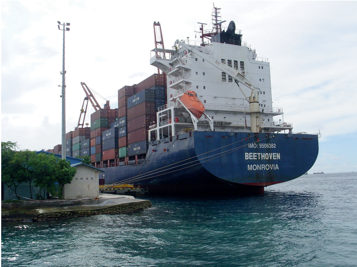
Fig. 3.3 for Question 3