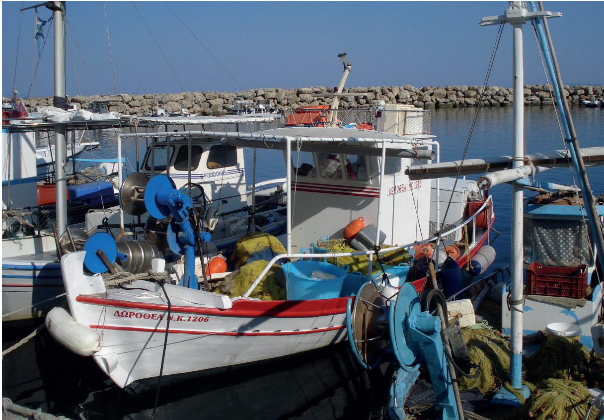
Fig. 3.2 for Question 3