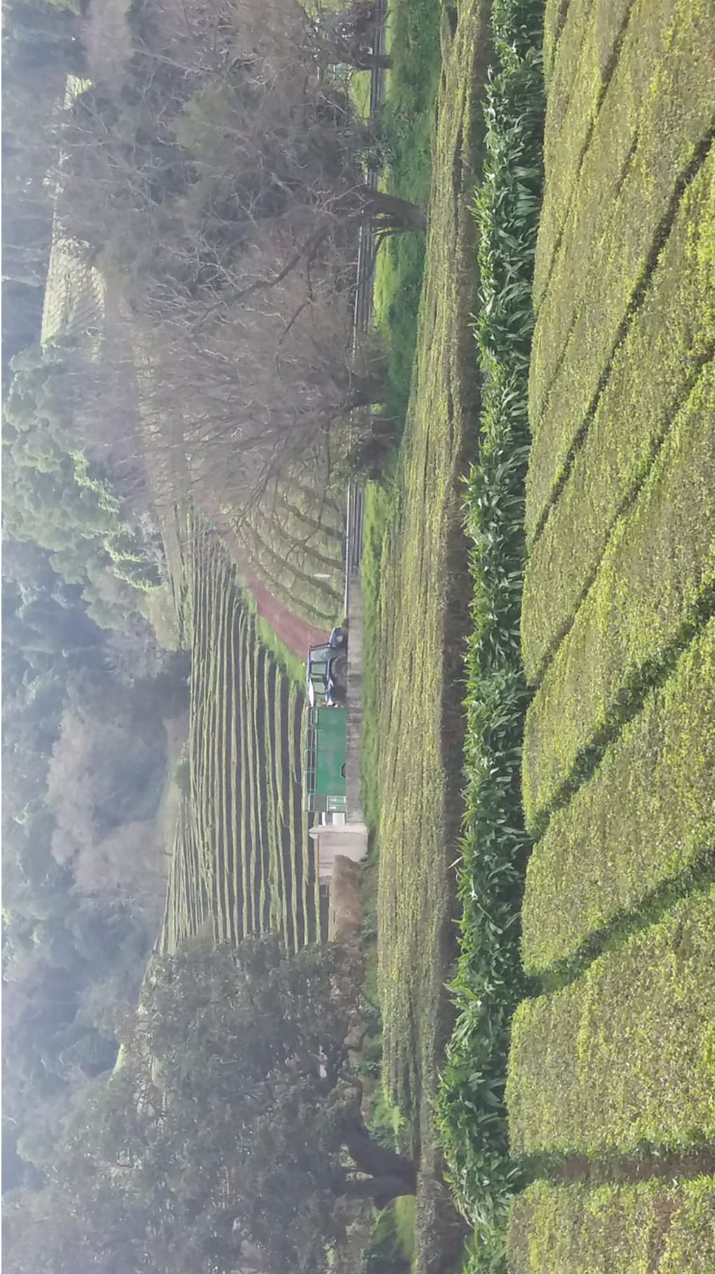
Fig. 3.1 for Question 3 Photograph of an agricultural area in a tropical country