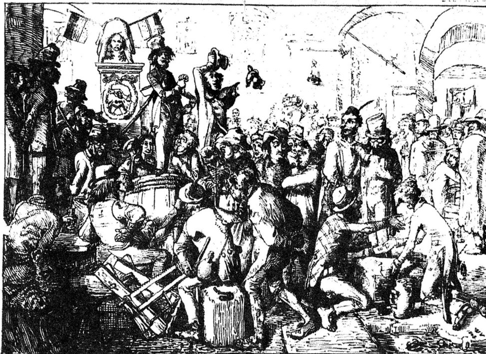
A cartoon published in Germany in 1848 entitled 'Parliament of the future'.