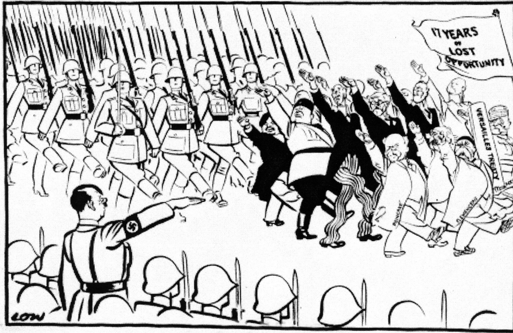
A cartoon, entitled 'Cause Precedes Effect', published in a British newspaper, 1935. It shows a parade of world statesmen led by the Versailles peacemakers.