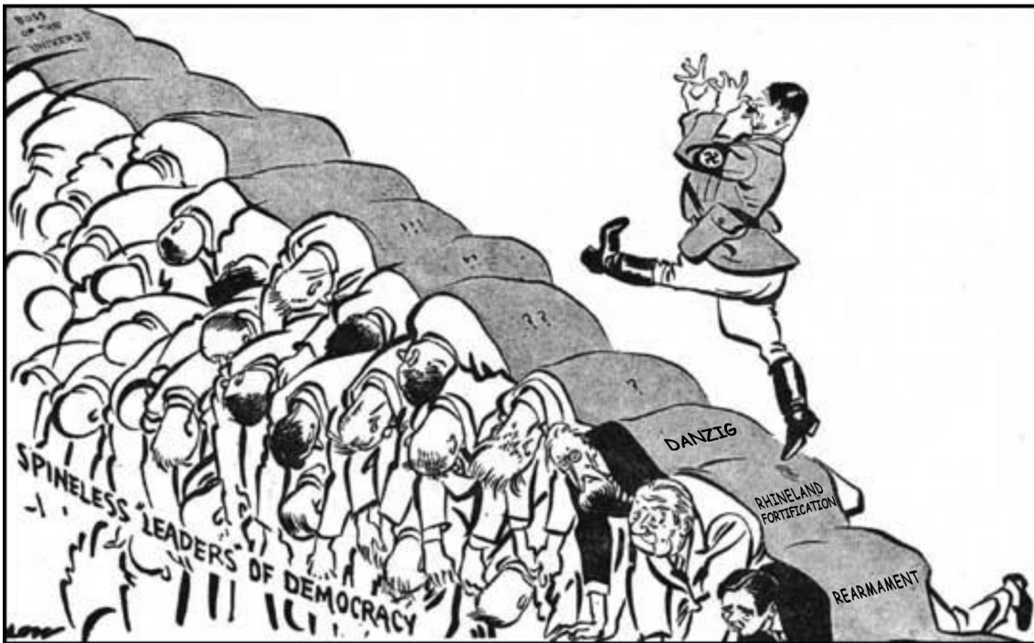
A cartoon, entitled 'Stepping Stones to Glory', published in a British newspaper, July 1936.