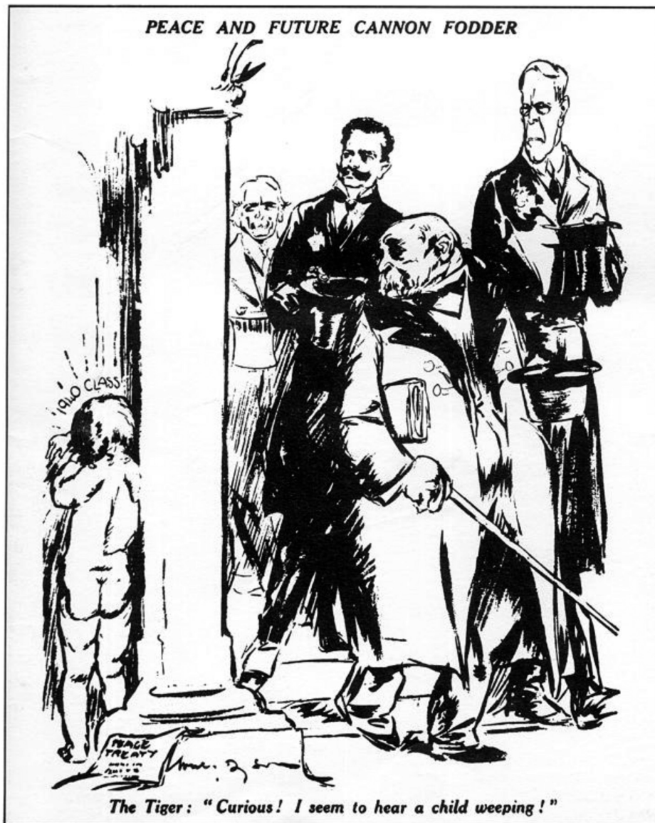
A cartoon published in a British newspaper, May 1919. 'The Tiger' refers to Clemenceau.