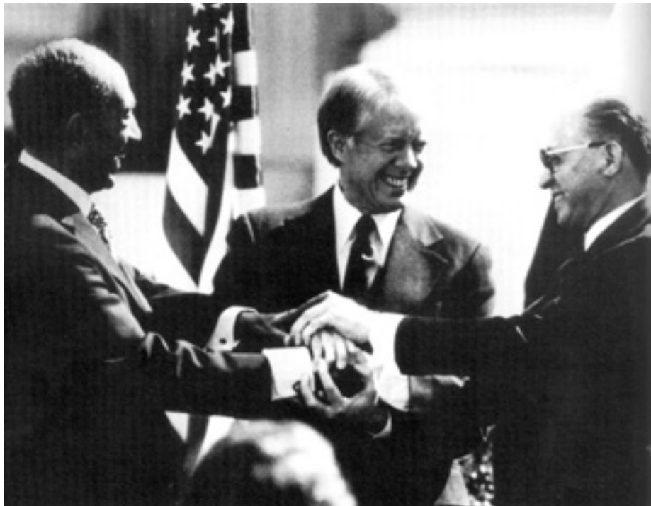
Begin, Sadat and US President Carter celebrate the peace treaty between Israel and Egypt, Washington DC, 16 March 1979.

21 Study the photograph and then answer the questions which follow.