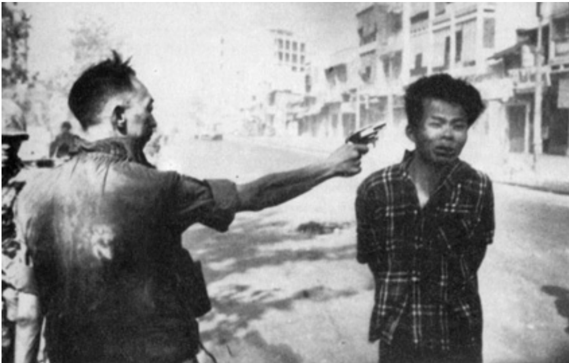
The execution of a Vietcong suspect during the Tet offensive, 1968.