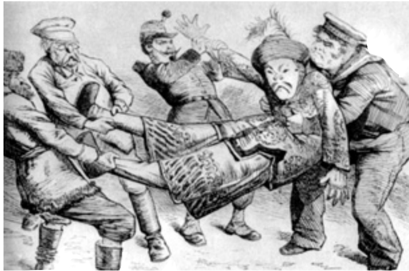
A nineteenth-century cartoon showing China being pulled by several European countries in different directions.

24 Study the cartoon, and then answer the questions which follow.