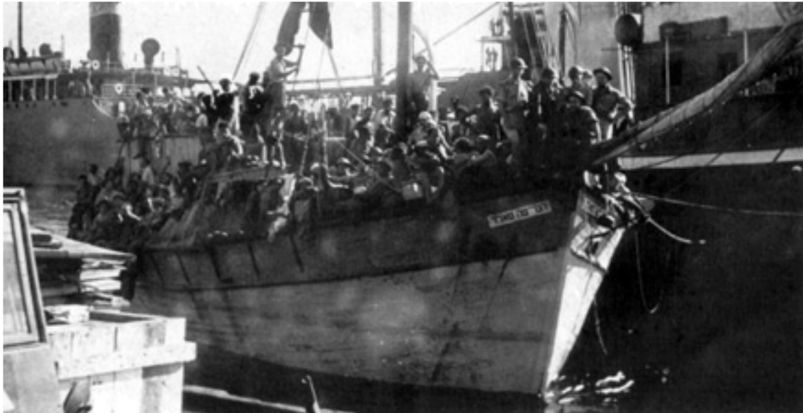
A refugee ship being sent back from Palestine to Cyprus by British soldiers in 1946.

20 Study the photograph, and then answer the questions which follow.