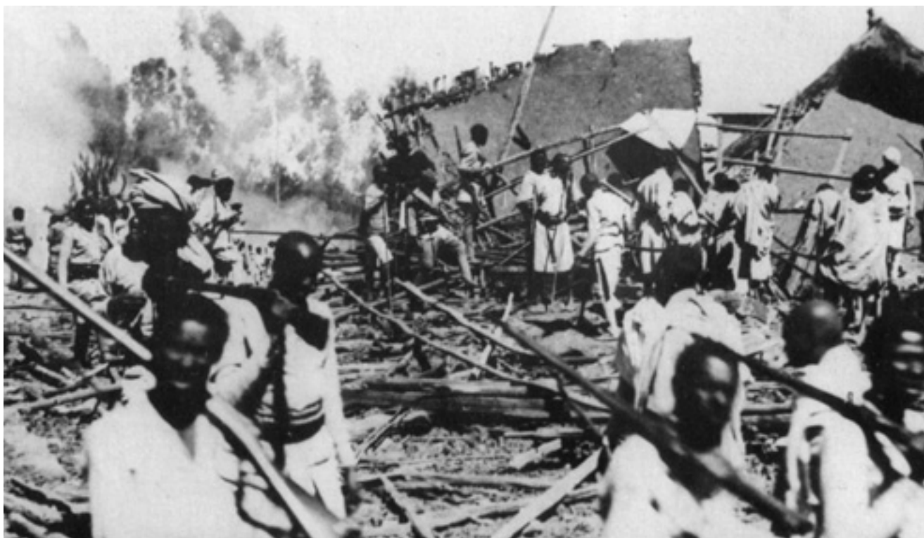
An Abyssinian village bombed by Italian aircraft in the invasion of 1936.

6 Study the photograph, and then answer the questions which follow.