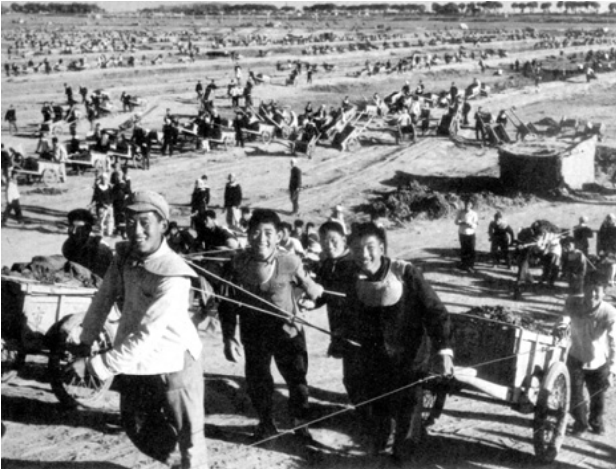
Chinese workers on the Haiho River Project.

15 Study the photograph, and then answer the questions which follow.