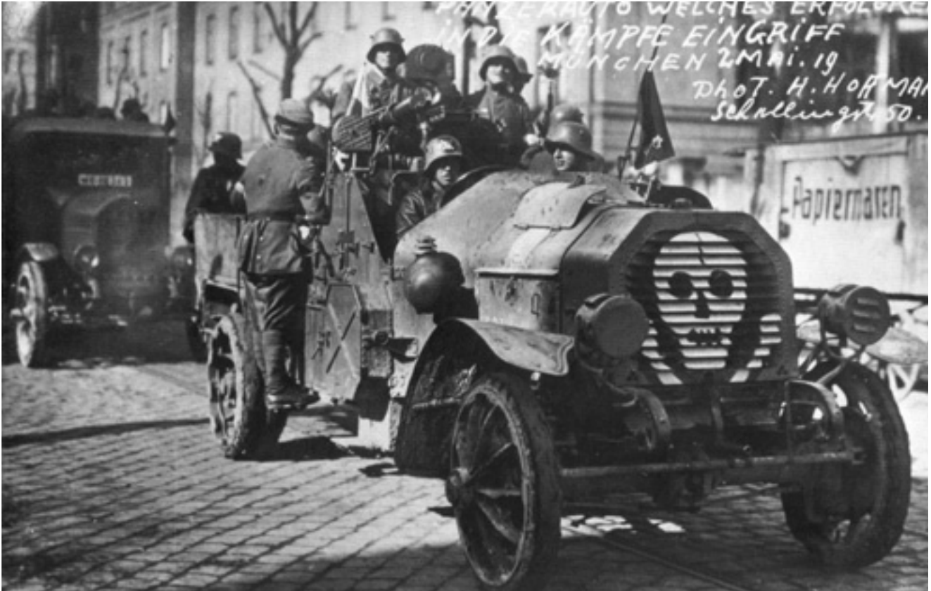
A Freikorps unit in Munich, May 1919.

9 Study the photograph, and then answer the questions which follow.