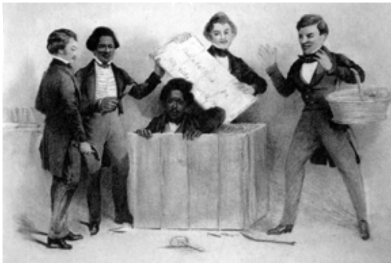
The escape of a slave from Richmond, Virginia to Philadelphia in the North.