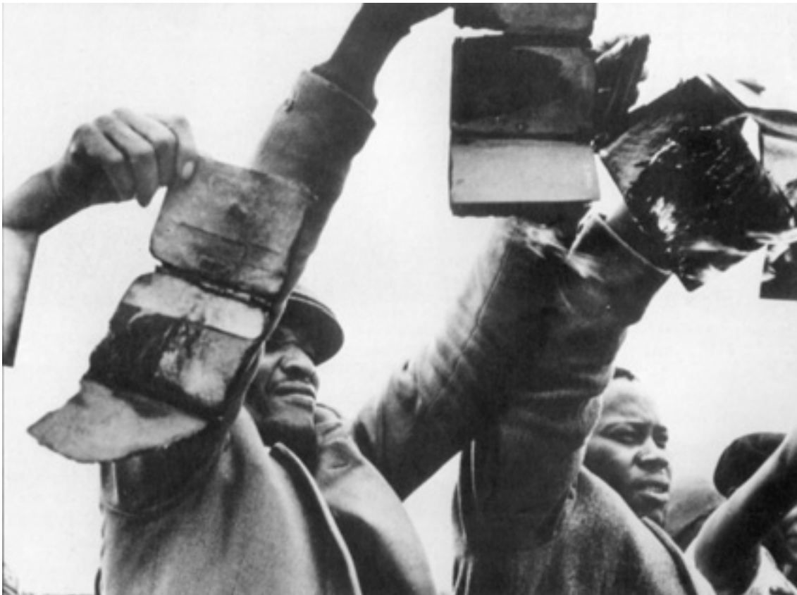
Pass books being burned in South Africa, 1960.

18 Study the photograph, and then answer the questions which follow.