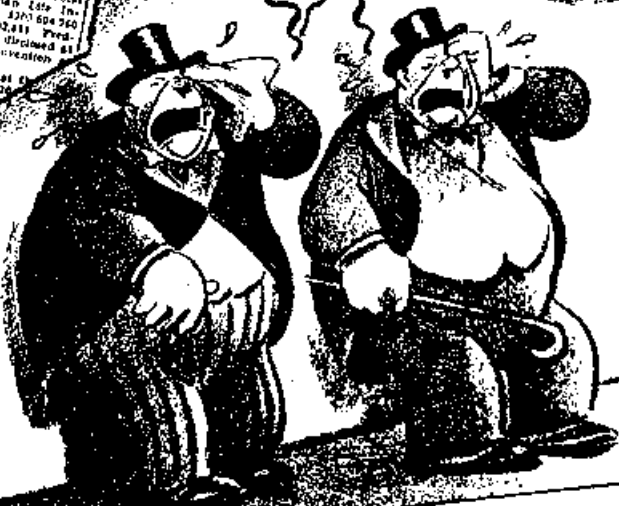
A cartoon published in a US newspaper in 1936.