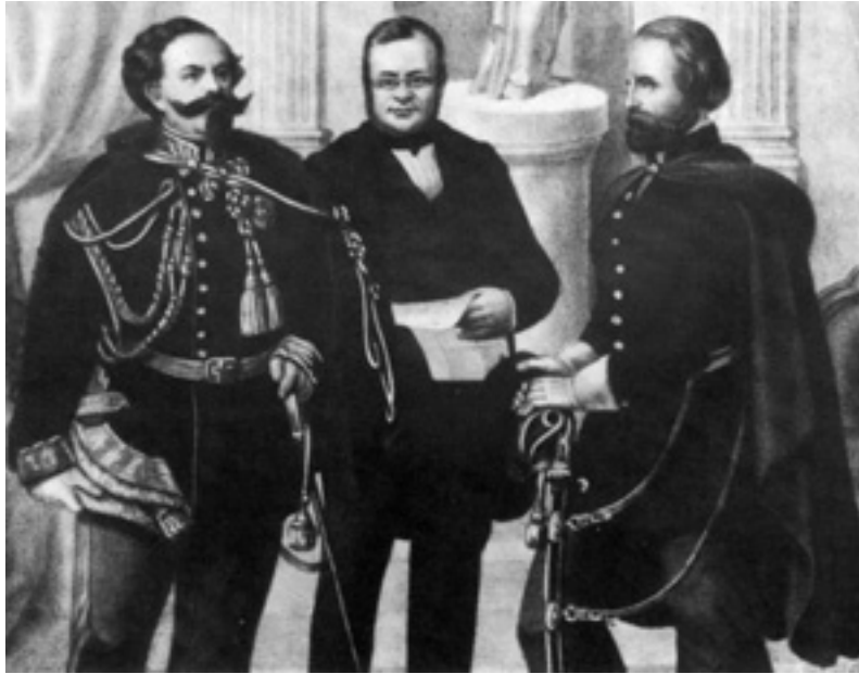
A painting from the 1860s of Victor Emmanuel II, Cavour and Garibaldi.