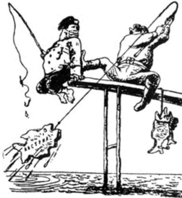
A Soviet cartoon published in an official government newspaper, 28 March 1938. It shows Hitler and Mussolini fishing. Hitler has just caught Austria.