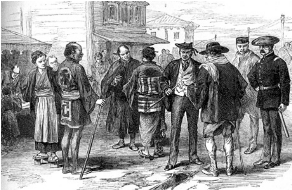
Traditional and western costume in Japan, 1873.