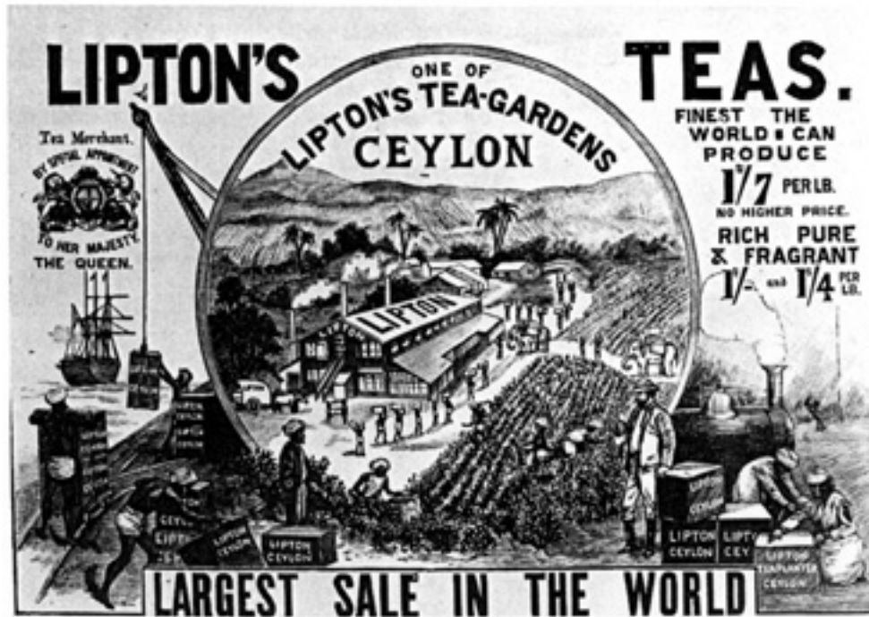
A Victorian advertisement showing a tea plantation.

24 Study the picture, and then answer the questions which follow.