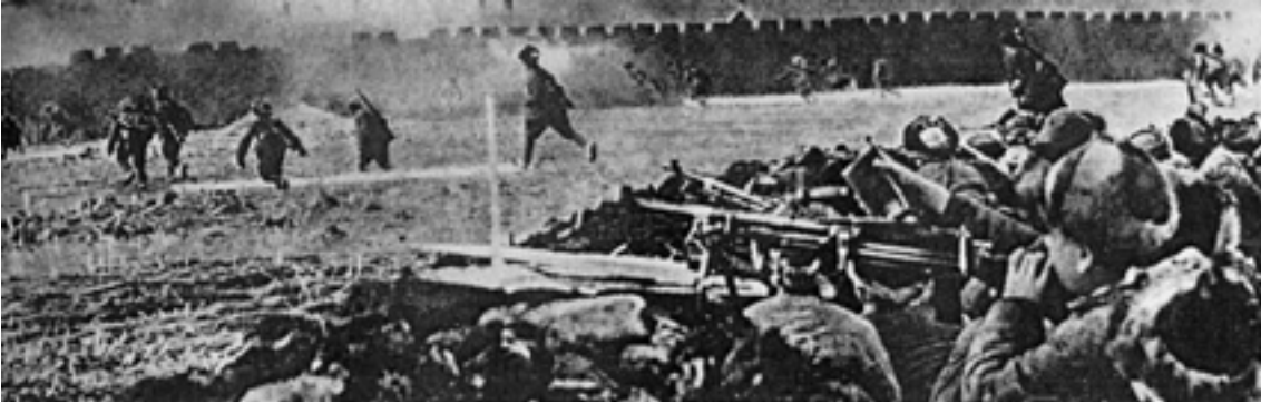
A photograph of Communist troops advancing in the Civil War.

15 Study the photograph, and then answer the questions which follow.