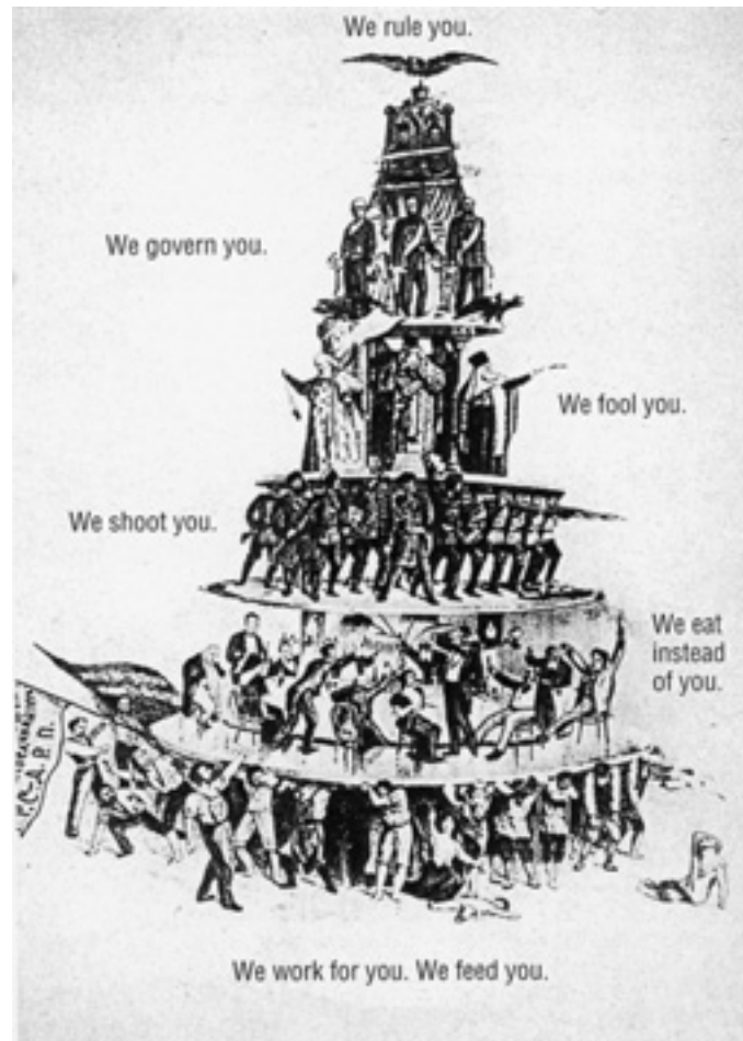
A cartoon, drawn about 1900, showing Russian society.

11 Study the cartoon, and then answer the questions which follow.