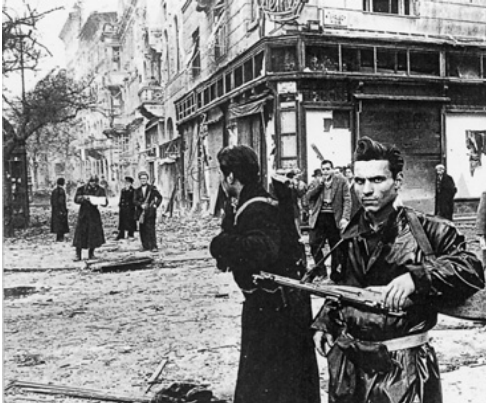
Hungarian rebels in Budapest, November 1956.

8 Study the photograph, and then answer the questions which follow.