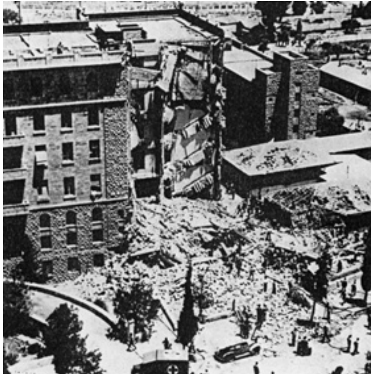
The King David Hotel, July 1946.

20 Study the picture, and then answer the questions which follow.