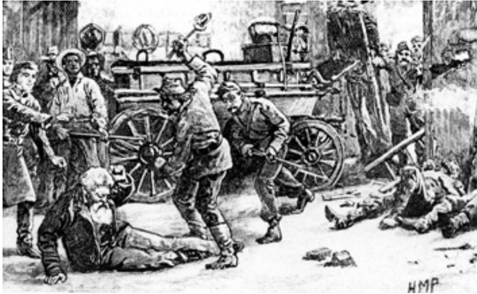
The capture of John Brown at Harper's Ferry, 1859.

3 Study the picture, and then answer the questions which follow.