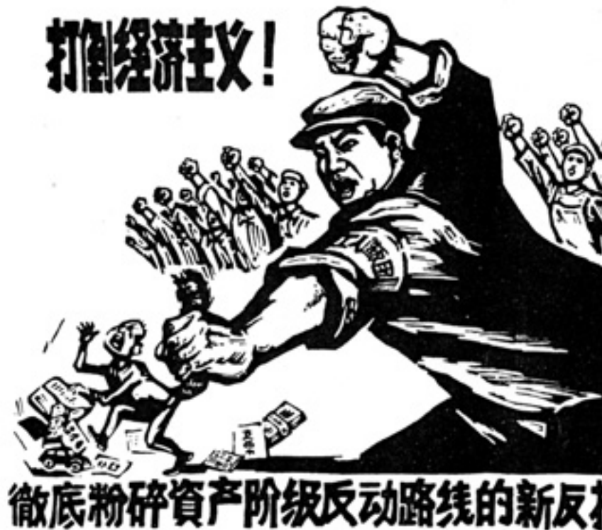
The Red Guards dealing with opponents during the Cultural Revolution.

16 Study the cartoon, and then answer the questions which follow.