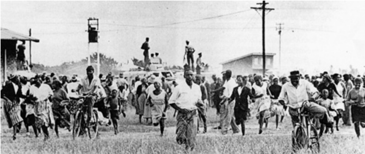
Protesters fleeing from the bullets at Sharpeville, 1960.

17 Study the picture, and then answer the questions which follow.