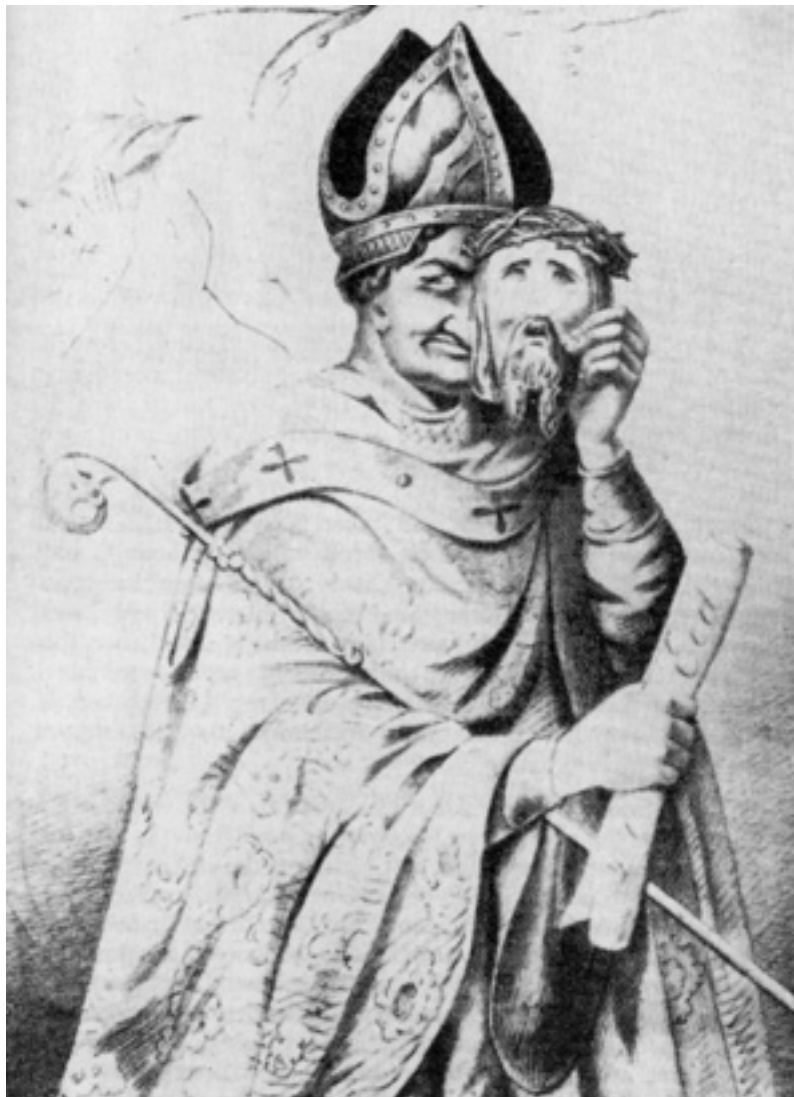
A cartoon drawing of Pope Pius IX from 1852.