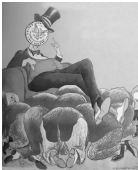
A Soviet cartoon published in 1947. The figures kneeling represent the European countries. They are kneeling in front of the US dollar.