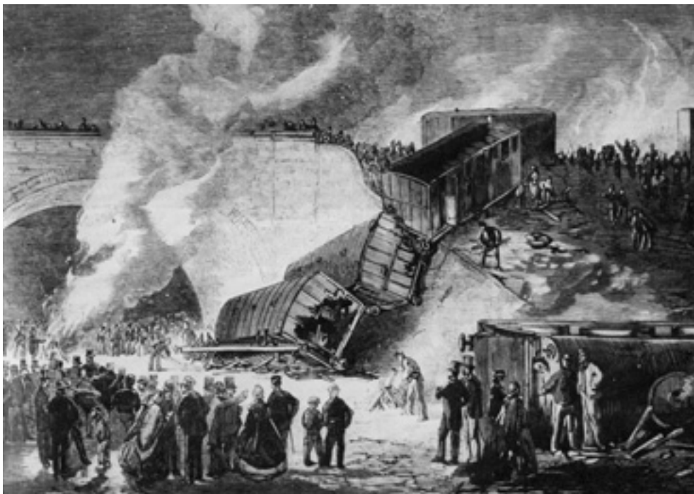
A print of a railway disaster near London in 1861.