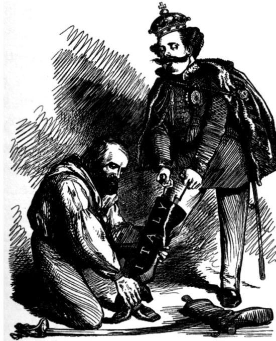
RIGHT LEG IN THE BOOT AT LAST.

“IF IT WON’T GO ON, SIRE, TRY A LITTLE MORE POWDER.”