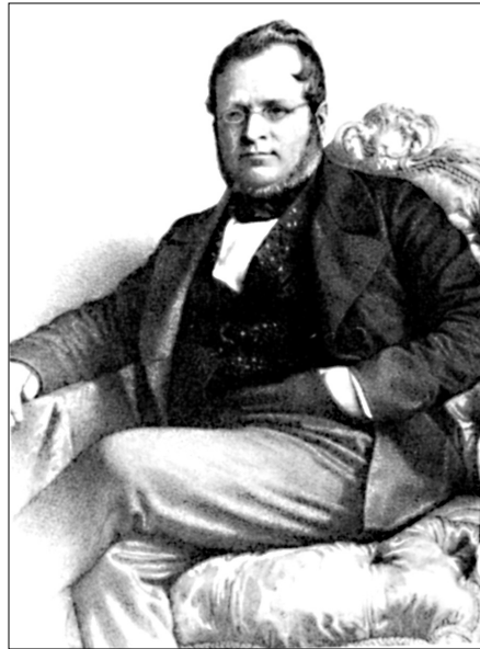
A painting of Cavour.