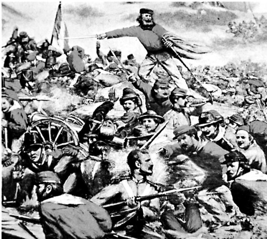
A drawing of Garibaldi at the Battle of Calatafimi in 1860 during the conquest of Sicily.