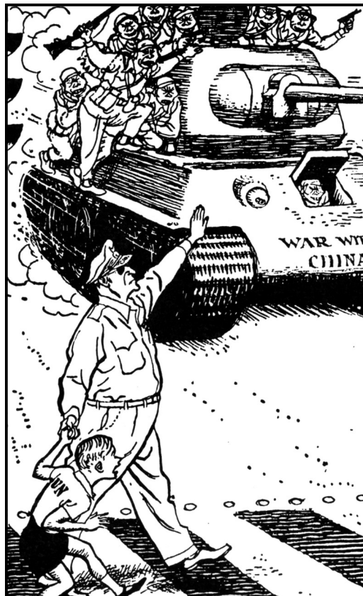
A cartoon from a British newspaper, November 1950. It shows General MacArthur ordering a South Korean tank to stop.