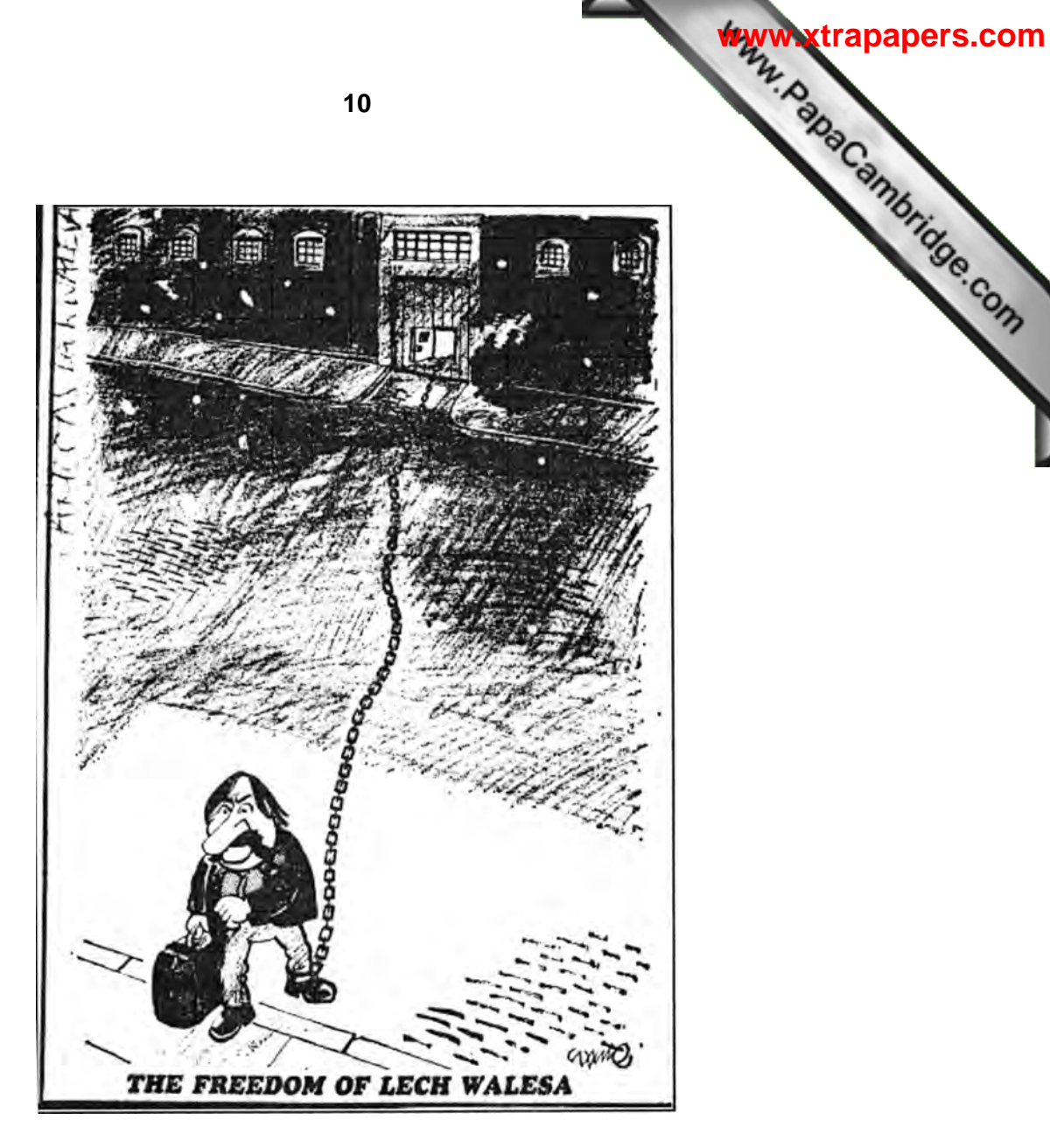
A cartoon published in an English newspaper in November 1982.