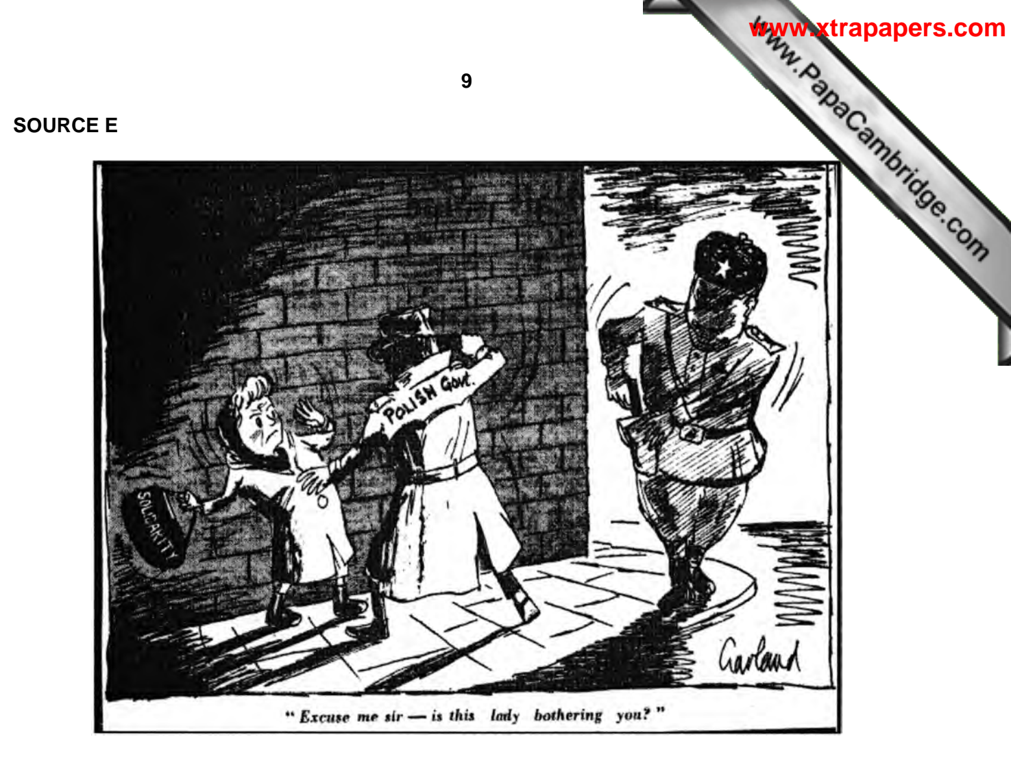
A cartoon published in an English newspaper in December 1980. The Russian soldier is saying 'Excuse me sir - is this lady bothering you?'.