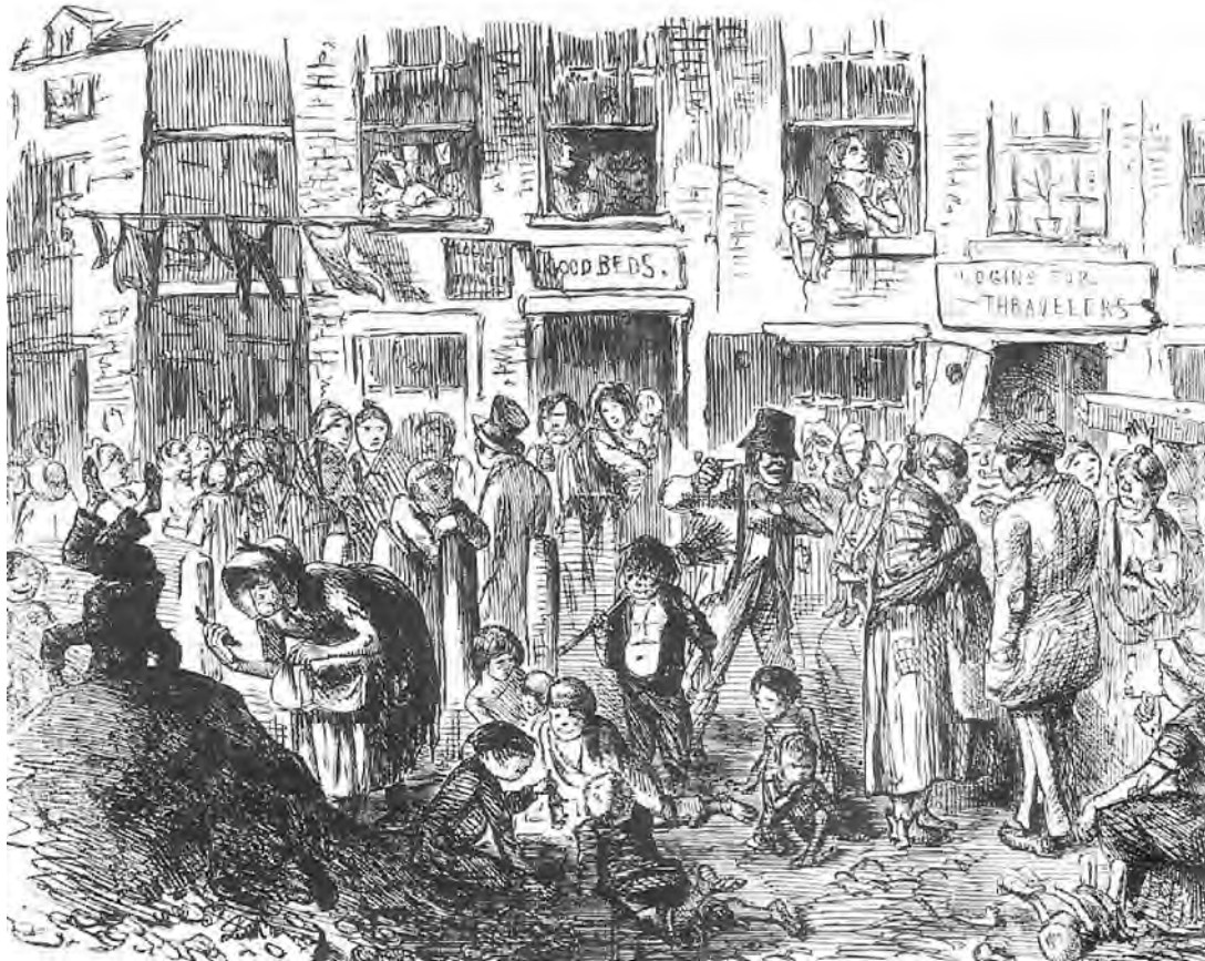
A British cartoon entitled 'A Court for King Cholera'. It was published in the mid-nineteenth century.

22 Study the cartoon, and then answer the questions which follow.