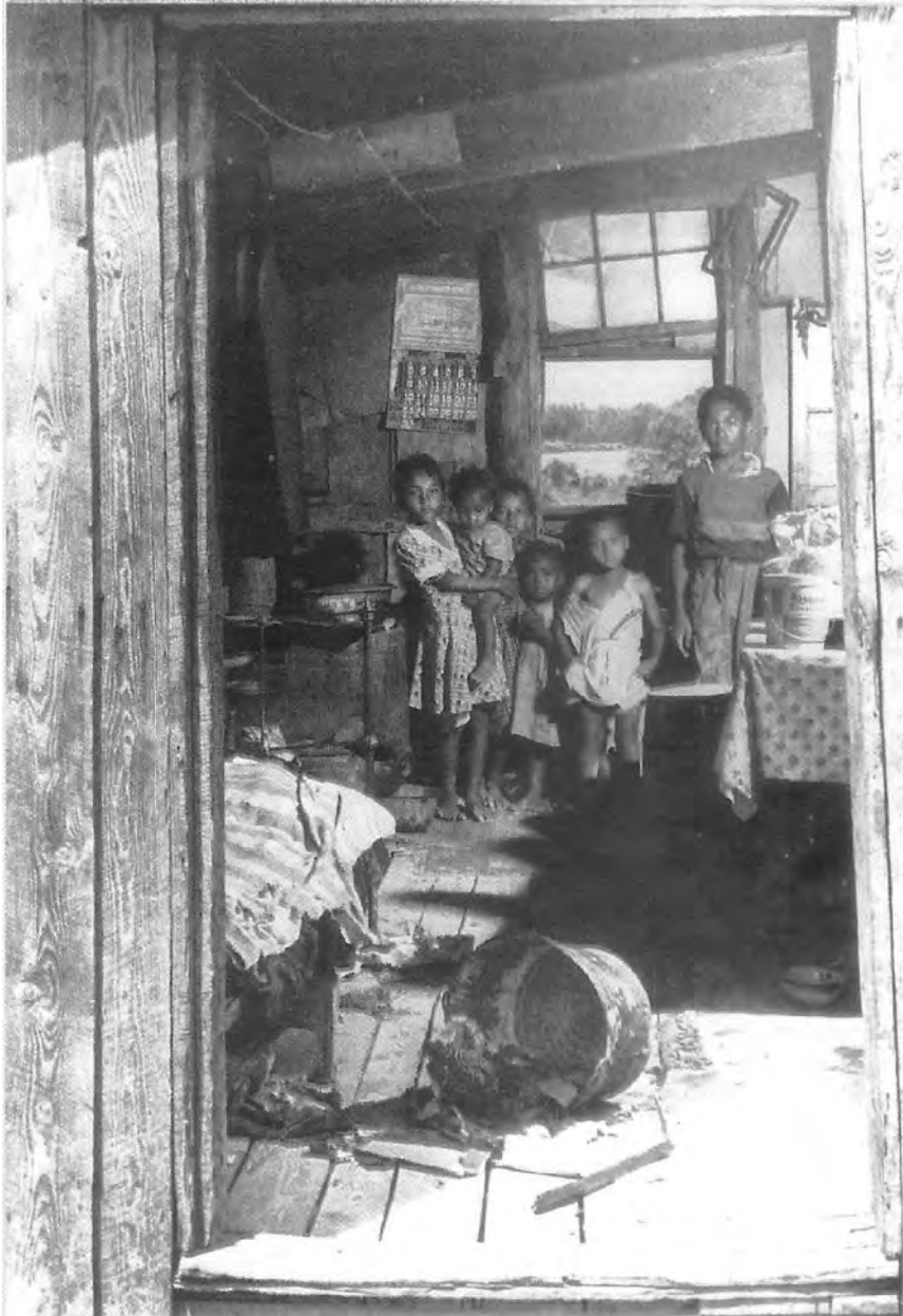
A family home in the Southern state of Virginia.

13 Study the illustration, and then answer the questions which follow.