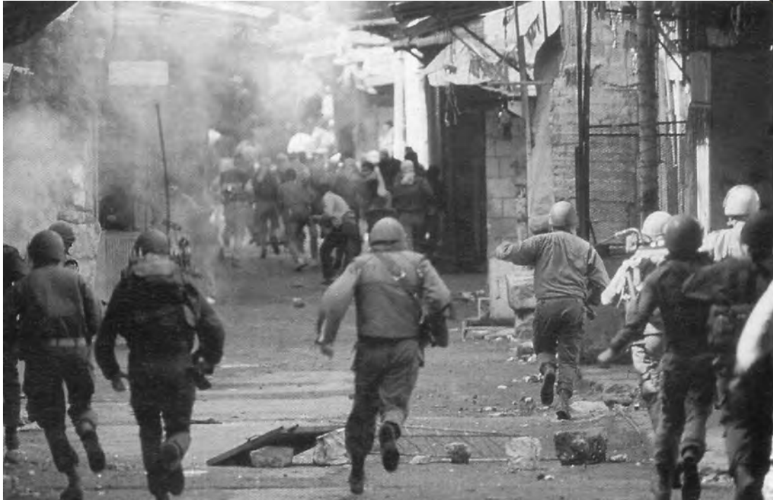
Stone-throwing Palestinians confronting heavily armed Israeli soldiers in the West Bank at the time of the Intifada.

21 Study the photograph, and then answer the questions which follow.