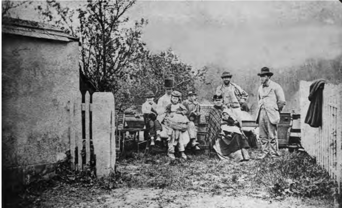
Farm labourers evicted from their home for being members of the National Agricultural Labourers' Union, 1874.

23 Study the picture, and then answer the questions which follow.