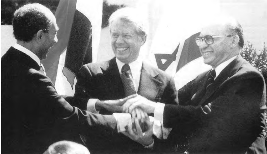
President Carter, President Sadat and Prime Minister Begin after signing a peace treaty in March 1979.

20 Study the photograph, and then answer the questions which follow.