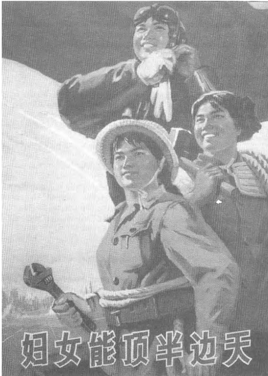
A Chinese poster showing female workers. The poster states that 'women hold up half the sky'.

16 Study the poster, and then answer the questions which follow.