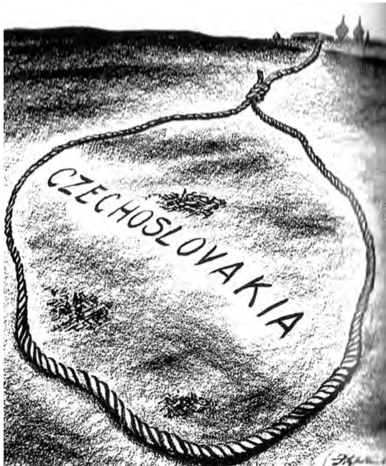
An American cartoon published in 1947. The title of the cartoon is 'When the time is right'.