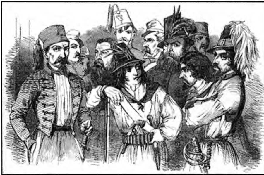
A drawing entitled 'Rome – Garibaldi's Men', published in an English magazine in July 1849.