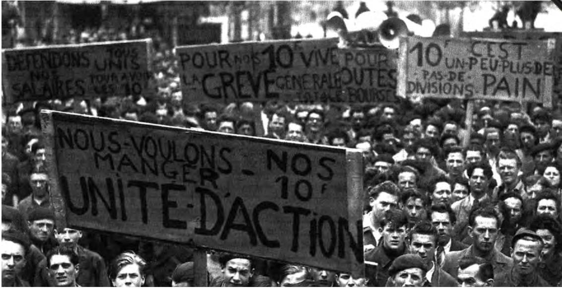
A photograph of workers in Paris demonstrating in 1947 for more pay, more bread and more united action by left-wing groups.