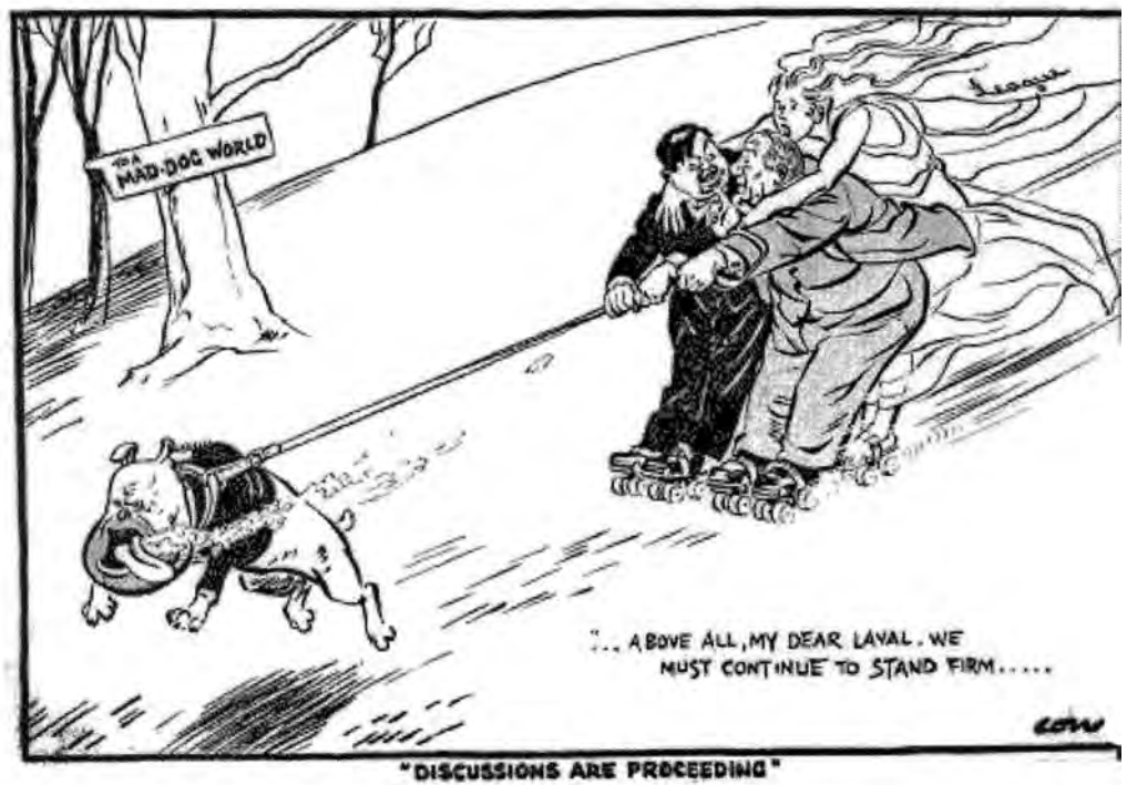
A British cartoon published in August 1935. The two men are Laval and Baldwin (Prime Minister of Britain).