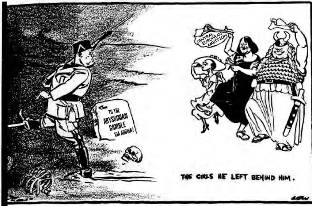
A British cartoon published in May 1935. The three figures on the right are Hitler and two of his leading ministers.