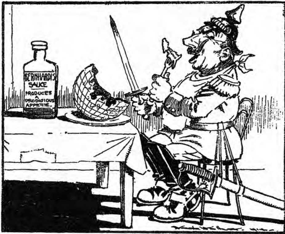
A cartoon published in Britain early in 1914. It is entitled 'The Kaiser's Dream: The End of the World'. Bernhardi was a German general who wrote a best-selling book entitled 'Germany and the Next War'.