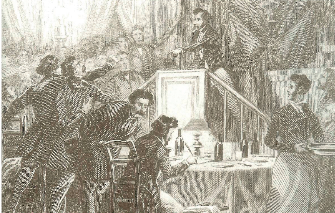
An illustration of a reform banquet held in Paris in 1847.