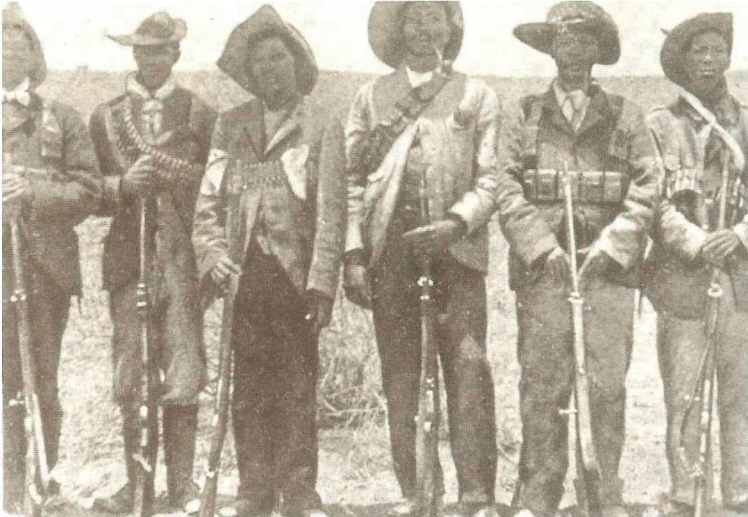
A photograph of Marenga and his guerrilla fighters in 1904.

19 Look at the photograph, and then answer the questions which follow.