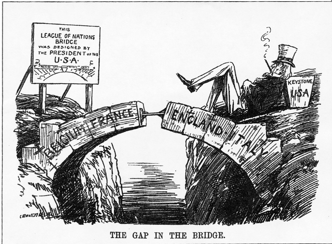
A cartoon published in a British magazine on 10 December 1919.