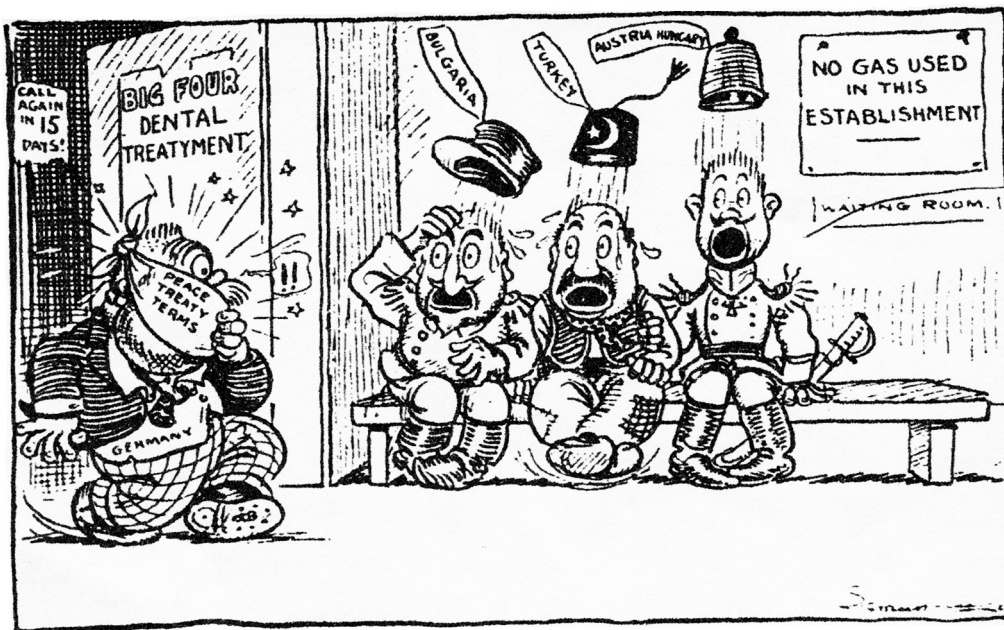
A cartoon published in Britain in May 1919.