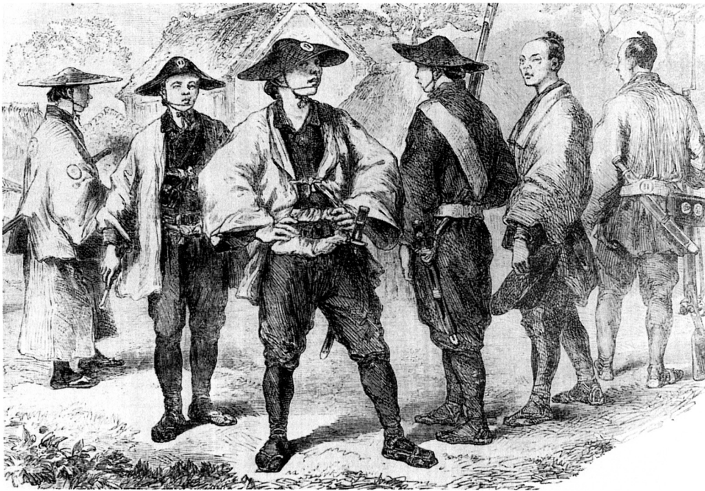
An illustration of Japanese soldiers in the 1860s in Western and traditional clothes.

4 Look at the illustration, and then answer the questions which follow.