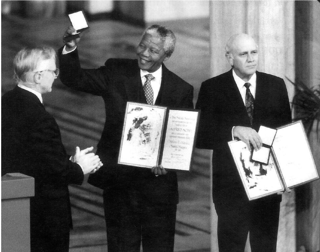
A photograph of Mandela and De Klerk receiving the Nobel Peace Prize in 1993.

18 Look at the photograph, and then answer the questions which follow.