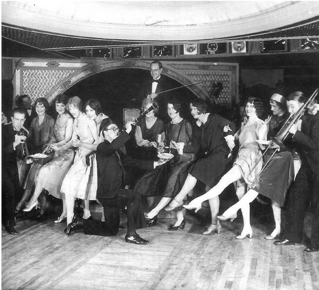
A photograph of young women dancing in 1920s America.

13 Look at the photograph, and then answer the questions which follow.