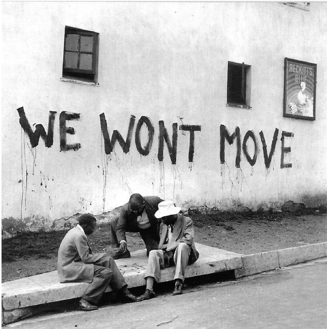
A photograph of the outside of a house in Sophiatown, 1955.

17 Look at the photograph, and then answer the questions which follow.