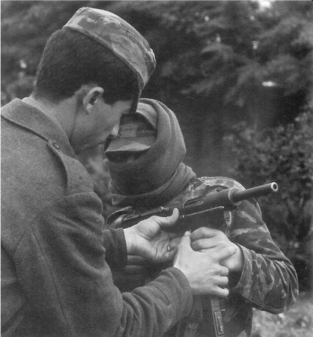
A young Fatah member receiving military training in 1966.

21 Look at the photograph, and then answer the questions which follow.