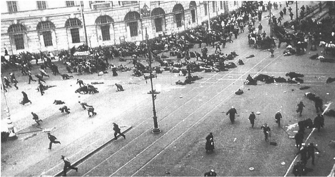
A photograph of troops firing on Bolshevik demonstrators in the streets of Petrograd, July 1917.

11 Look at the photograph, and then answer the questions which follow.