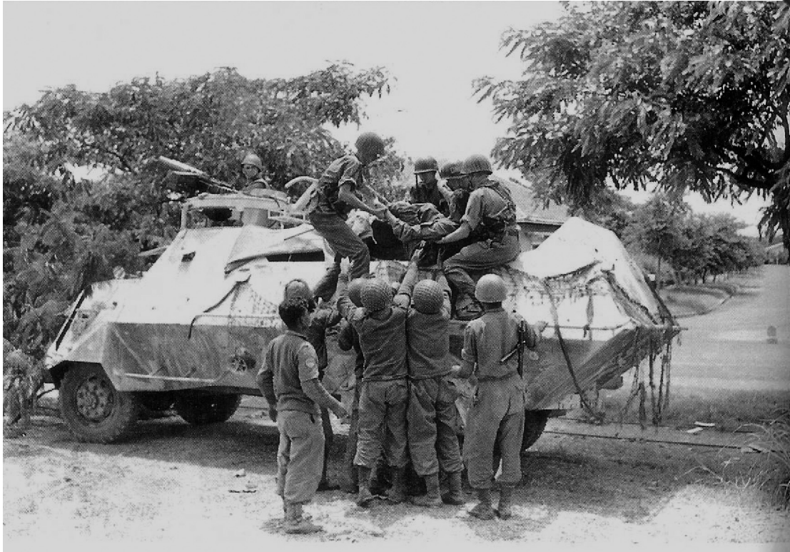
A photograph of a wounded soldier being lifted from a UN vehicle in the Congo in 1960.

8 Look at the photograph, and then answer the questions which follow.