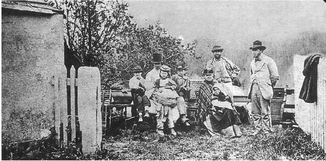
A photograph of a family of farm labourers taken in 1874. They have been evicted from their home. The labourers were members of the National Agricultural Labourers' Union.

23 Look at the photograph, and then answer the questions which follow.