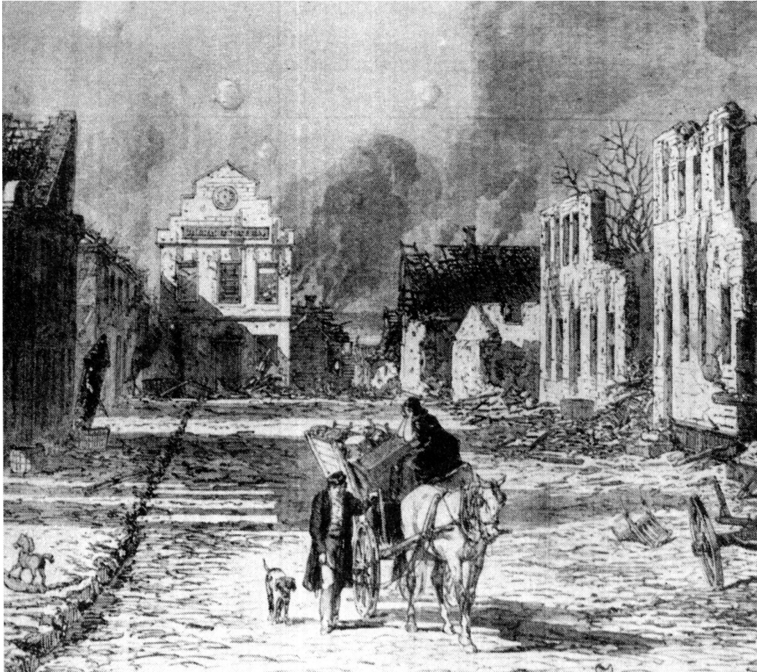
An illustration showing a Danish town in ruins after a bombardment by Prussian forces during the war of 1864.

2 Look at the illustration, and then answer the questions which follow.