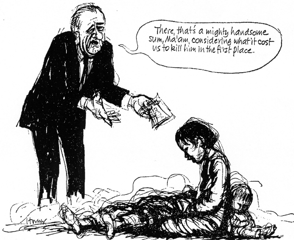
(The US is spending more than $40,000,000 per day on the war in Vietnam; compensation payments for South Vietnamese civilians killed 'by mistake' are $34 per head.)