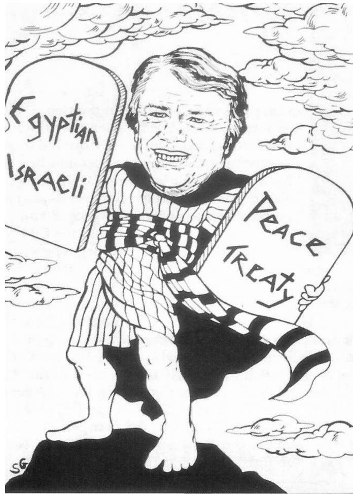
An American cartoon, showing President Carter, published in 1978.

20 Look at the cartoon, and then answer the questions which follow.