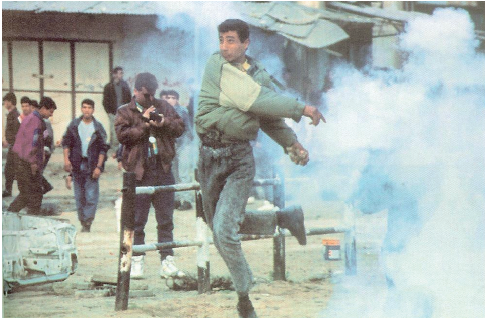
A photograph of a Palestinian protester in Hebron.

21 Look at the photograph, and then answer the questions which follow.