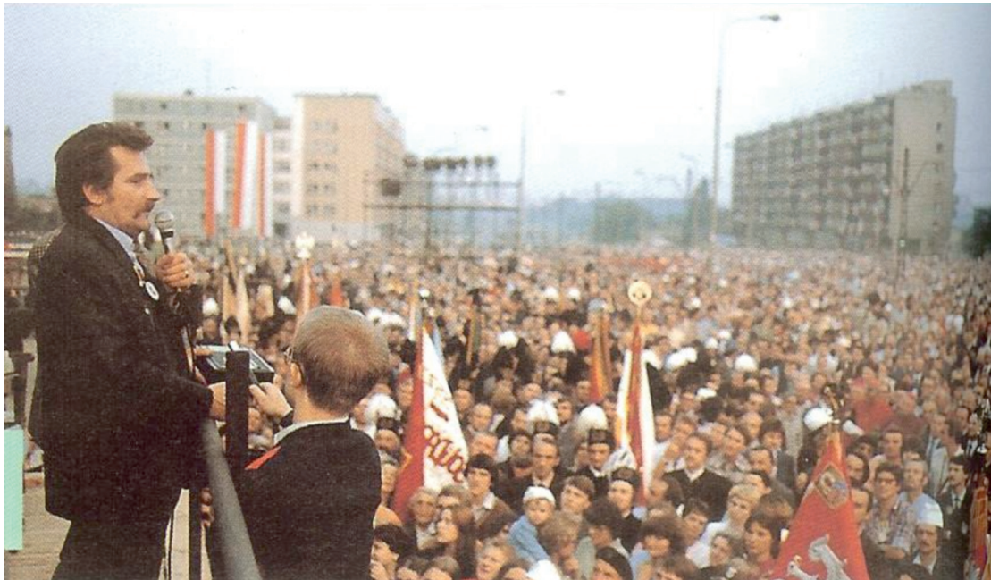
A photograph of Lech Walesa, the 'Solidarity' leader, speaking at Gdansk in 1980.

8 Look at the photograph, and then answer the questions which follow.