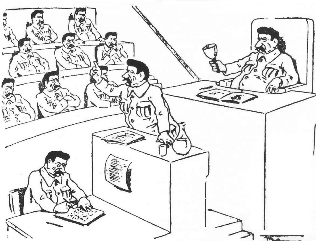
A cartoon published by Russian exiles in Paris in 1936. The title of the cartoon is 'The Stalinist Constitution – New seating arrangements in the Supreme Soviet'.

12 Look at the cartoon, and then answer the questions which follow.