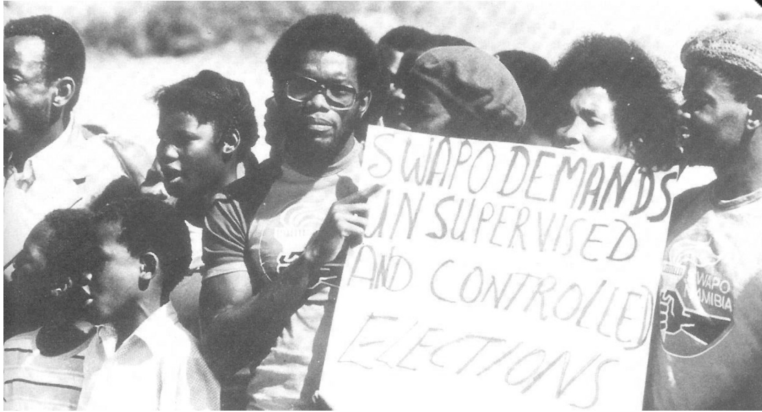
A photograph of a SWAPO protest in 1978.

19 Look at the photograph, and then answer the questions which follow.