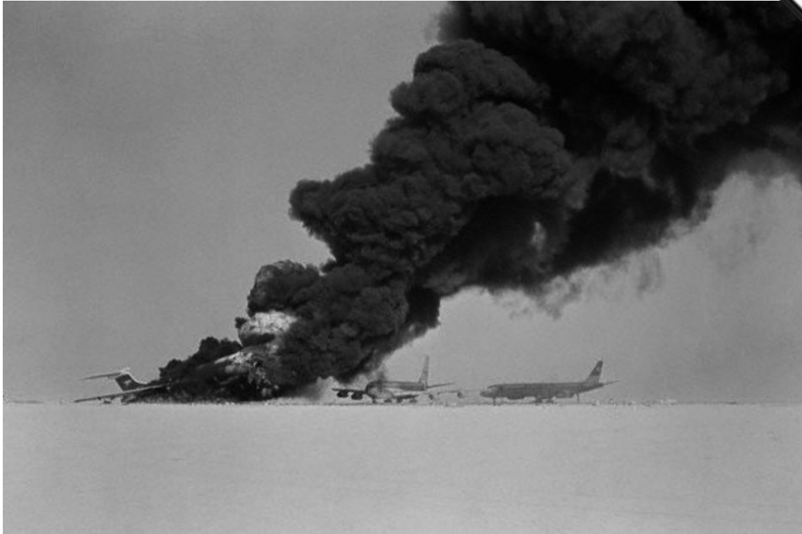
A photograph of a hijacked airliner, Jordan 1970.

21 Look at the photograph, and then answer the questions which follow.