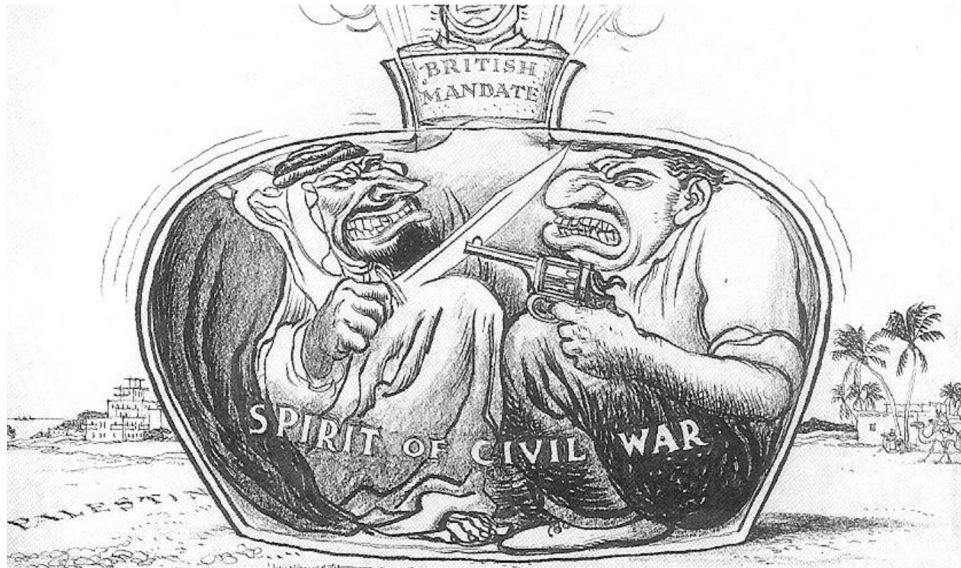
A cartoon published in a British newspaper, September 1947.

20 Look at the cartoon, and then answer the questions which follow.