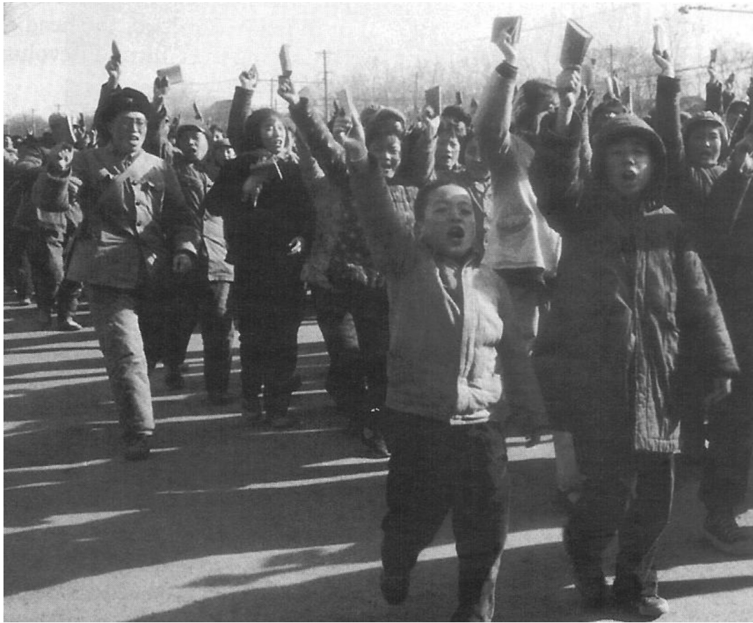
A photograph of Red Guards on the streets of Beijing during the Cultural Revolution.

16 Look at the photograph, and then answer the questions which follow.