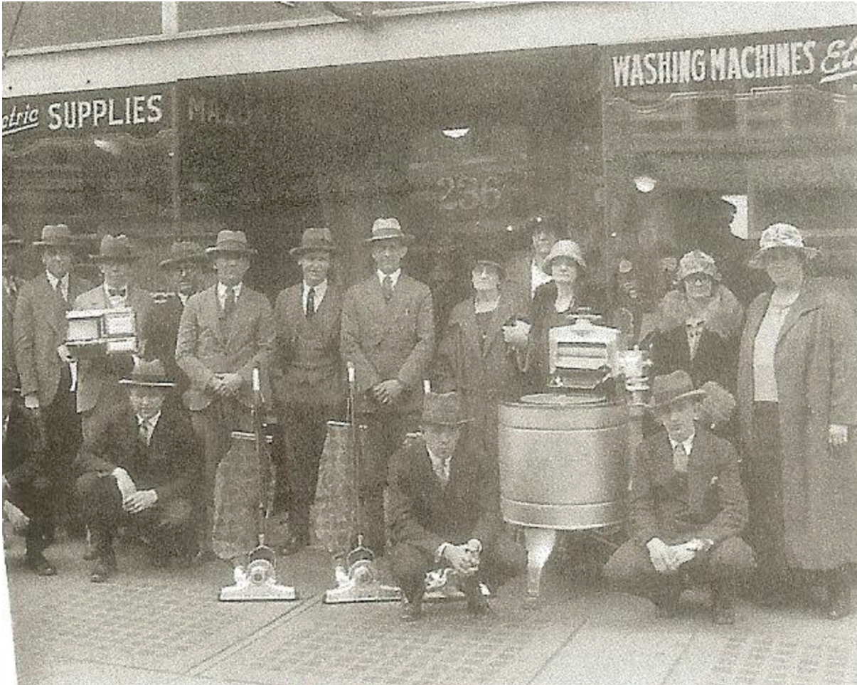
A photograph of sales staff taken in the early 1920s.

13 Look at the photograph, and then answer the questions which follow.