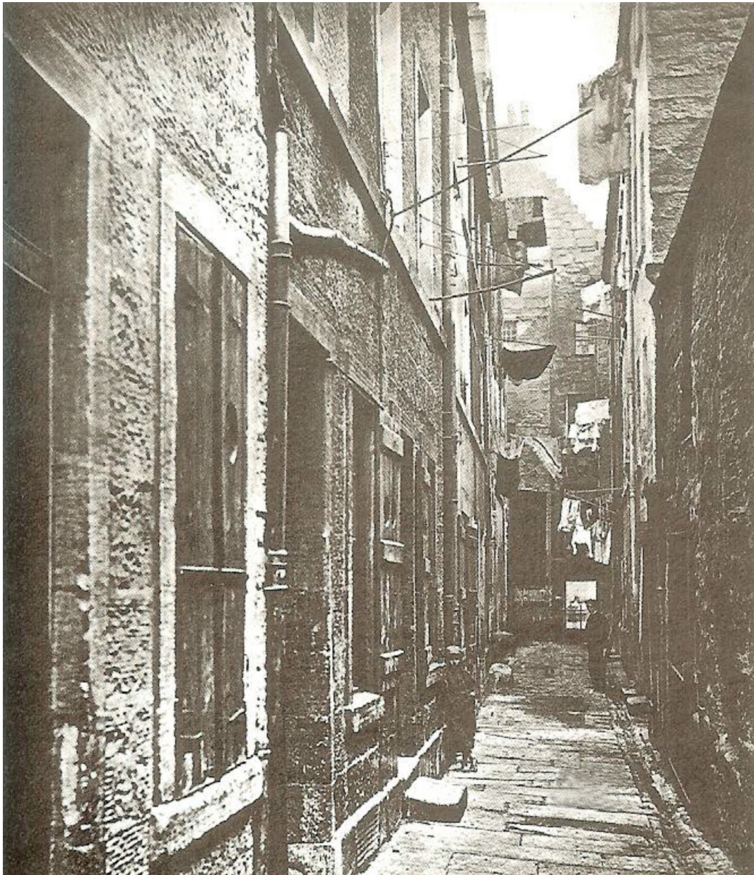
A photograph of housing in Glasgow, Scotland, in 1868.

23 Look at the photograph, and then answer the questions which follow.