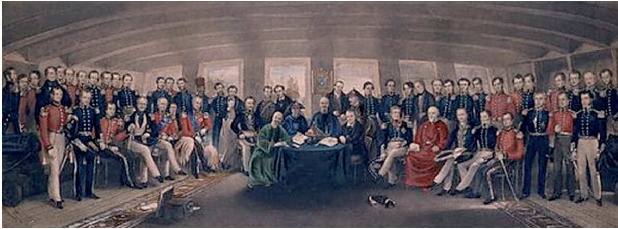
The signing of the Treaty of Nanking in August 1842. It marked the end of the First Opium War in which China suffered military defeat.

24 Look at the picture, and then answer the questions which follow.