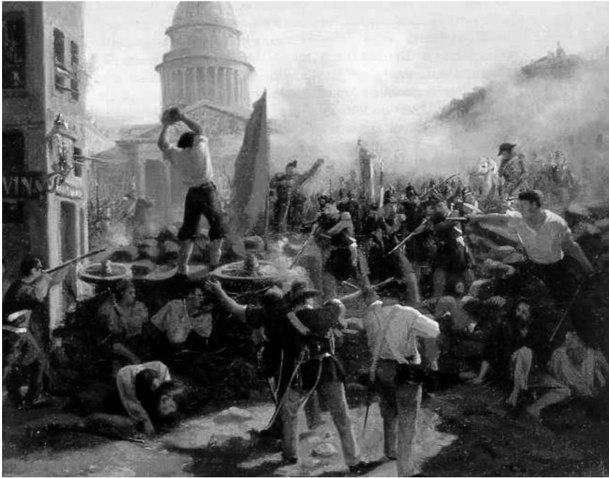
A French painting, from the time, of barricades in Paris on 24 June 1848.