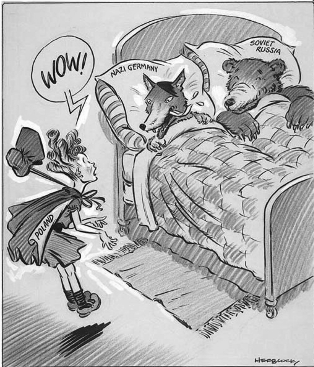
A cartoon published in America in September 1939.