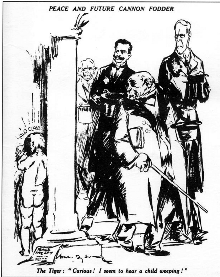
A cartoon published in a British newspaper, May 1919. 'The Tiger' refers to Clemenceau.