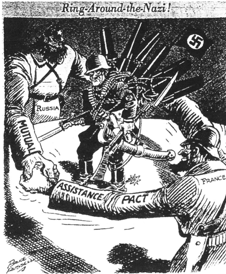
An American cartoon published in March 1936.