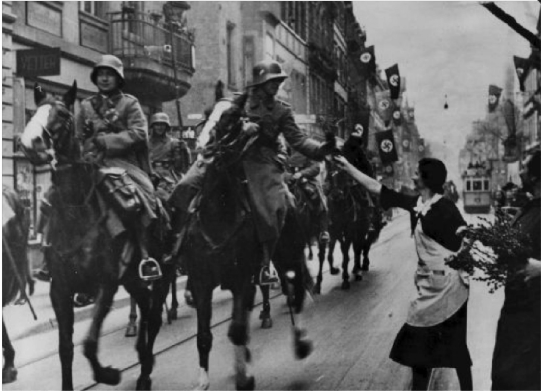
A photograph of German troops riding into the Rhineland on 7 March 1936.