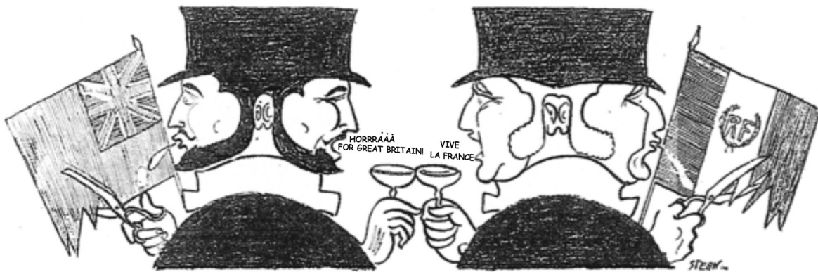
A cartoon published in Germany in 1903. The title of the cartoon is 'See the French-English alliance'.