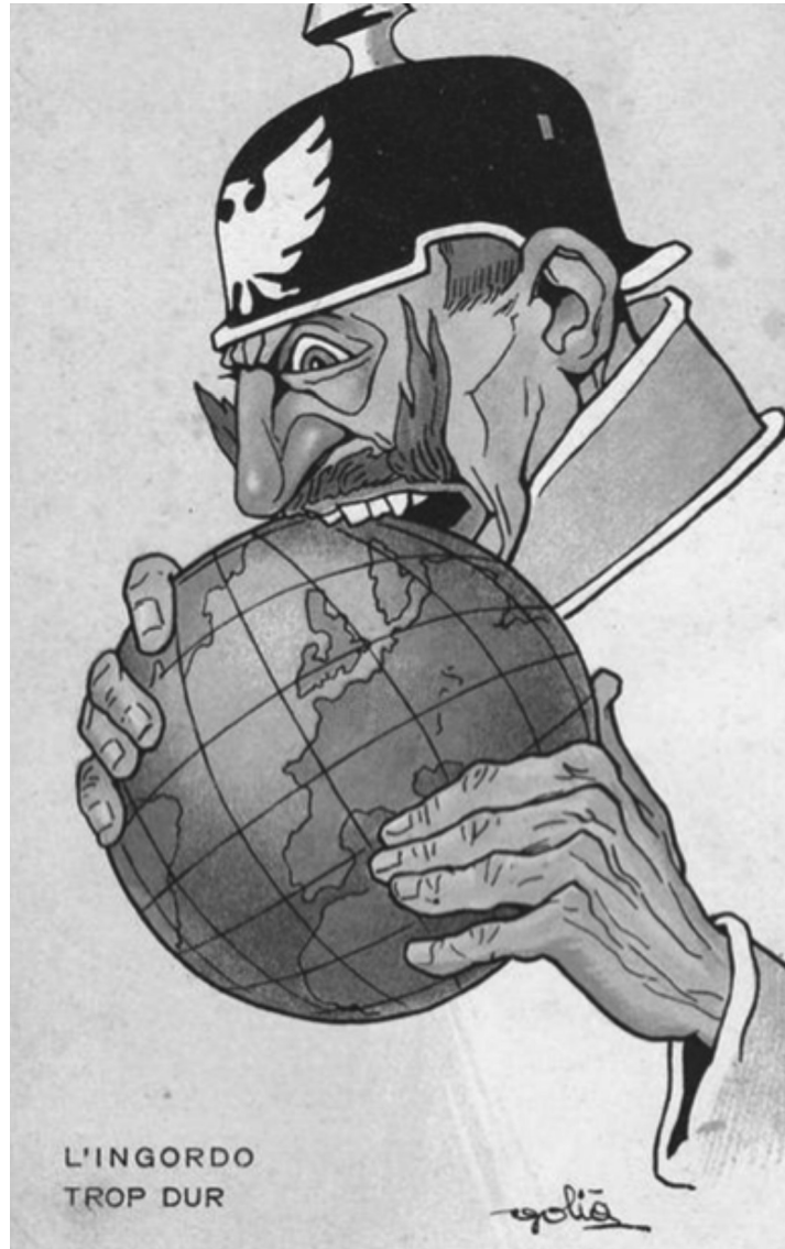
A French postcard published at the beginning of the war. The caption reads 'The glutton – too hard'. A glutton is someone who eats too much.