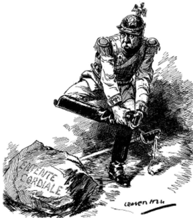
A British cartoon, entitled 'Solid', published in August 1911. The Kaiser is saying 'Donnerwetter! It's rock. I thought it was going to be paper.'