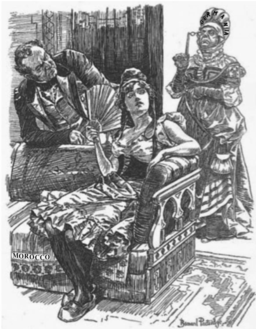
A British cartoon published in April 1905. Its title is 'The Matchmaker, despite herself.' The French woman sitting says to Britain, 'If she's going to glare at us like that, it almost looks as if we might have to be properly engaged.'