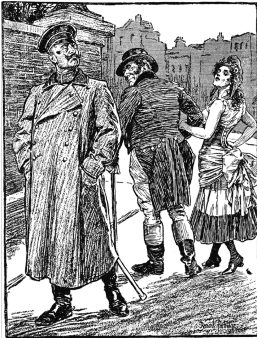
A cartoon published in Britain in 1904. Britain is shown with France.