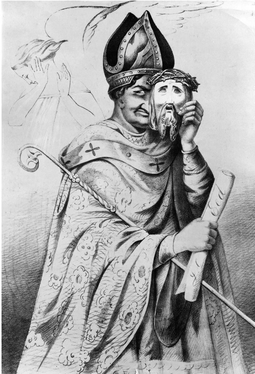
A cartoon of Pope Pius IX published in 1852. He is holding a mask of Christ.