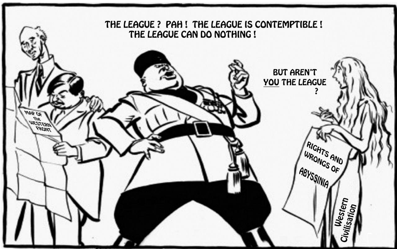
A British cartoon published in February 1935.