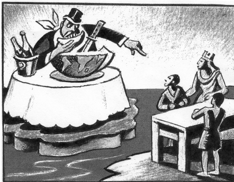
An Italian cartoon showing Britain (top left) criticising Italy (bottom right) over Abyssinia. This cartoon was published in October 1935 in a newspaper founded by Mussolini.