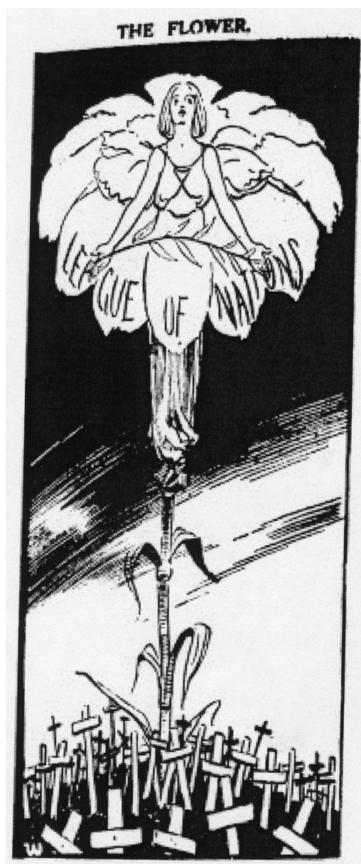
A British cartoon published in November 1919.