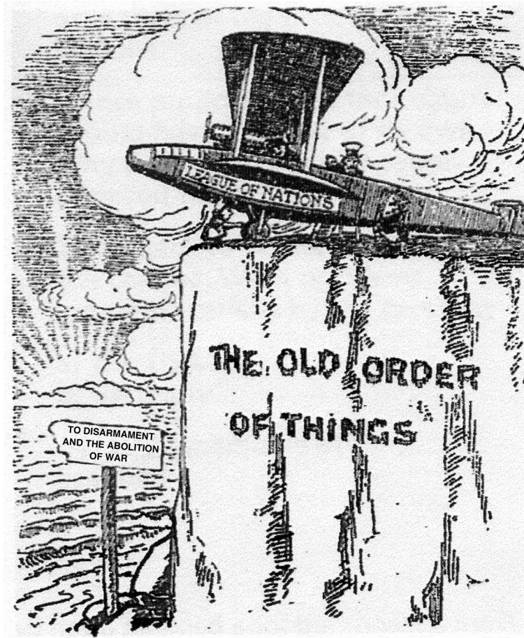
A British cartoon published in 1919.