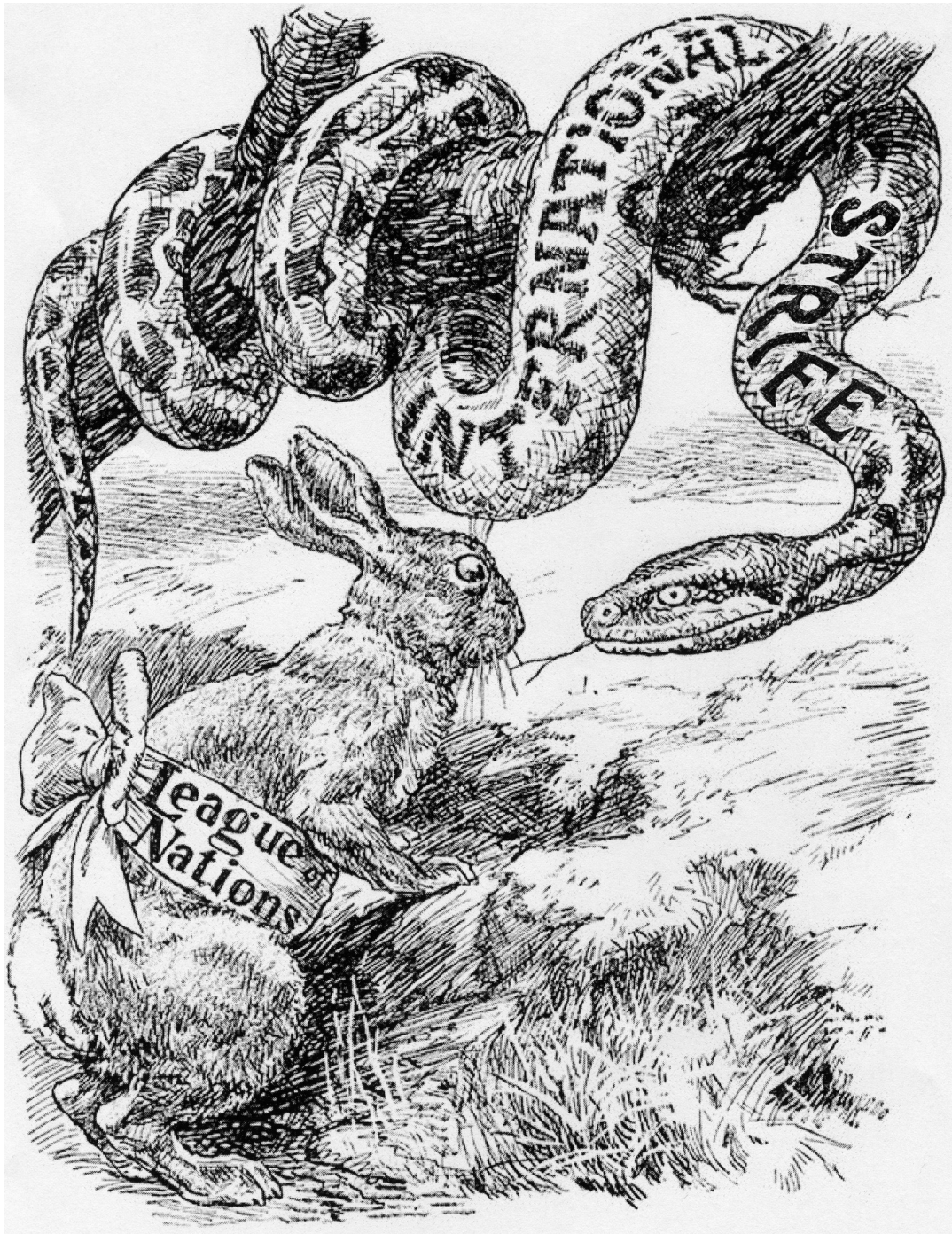
A British cartoon entitled 'Moral Persuasion', published in 1920. The rabbit is saying 'My offensive equipment being practically nil, it remains for me to fascinate him with the power of my eye.'