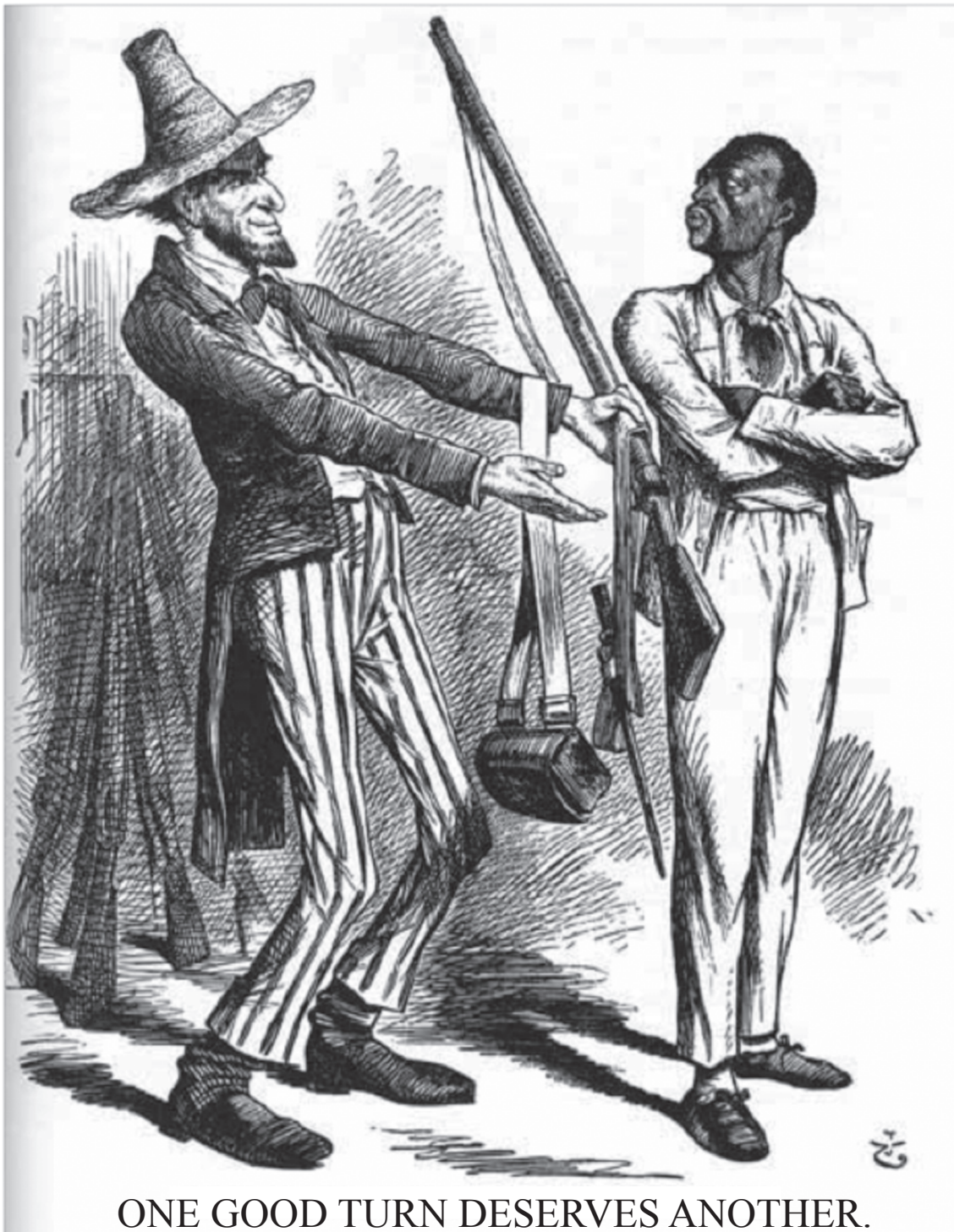
A cartoon published in Britain in August 1862. Lincoln is saying 'Why I do declare it's my dear old friend! Of course you'll fight for us. Lend us a hand old friend!'